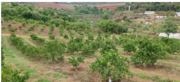
Figure 3: Machado Campus orchard.