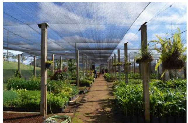
Figure 16: Muzambinho Campus gardening and landscaping greenhouse.