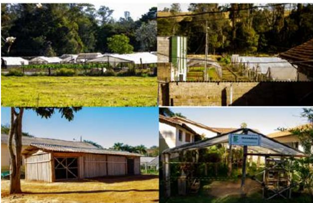
Figure 25: Inconfidentes Campus vegetable and herb gardens.