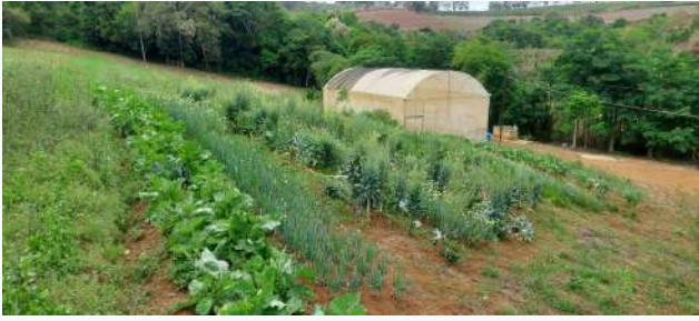
Figure 5: Machado Campus vegetable garden.