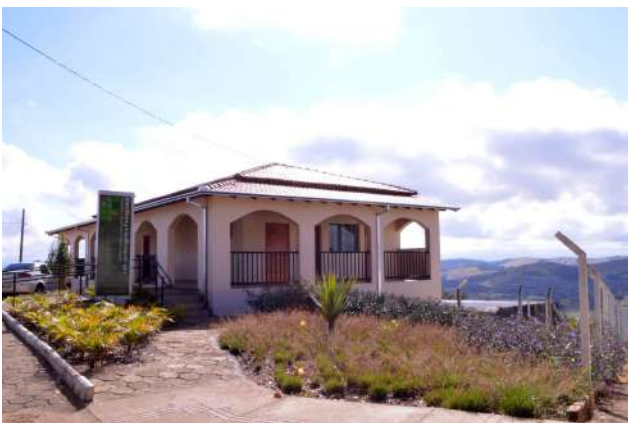
Figure 15: Muzambinho Campus Gardening and Landscaping Laboratory.