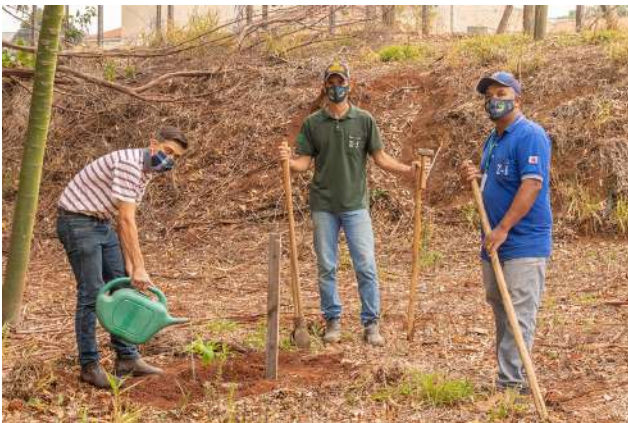
Figure 13: Muzambinho Campus celebrates Tree Day with around 60,000 seedlings donated in 2 years.