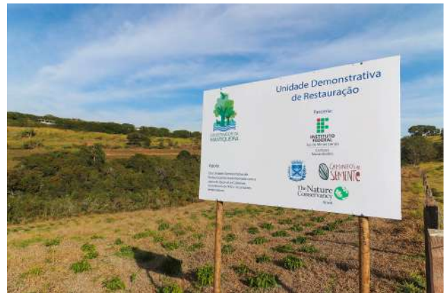
Figure 14: Muzambinho Campus participates in reforestation research project.