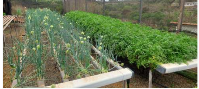
Figure 6: Machado Campus greenhouse in vegetable garden.