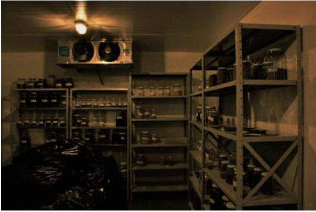
Figure 23: Inconfidentes Campus “Mother Earth” Seed Community House.