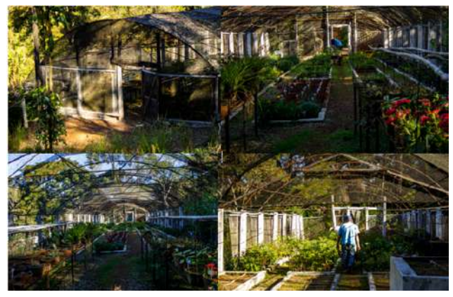
Figure 24: Inconfidentes Campus plant nursery sector.