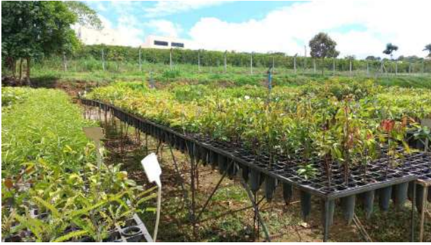
Figure 11: Muzambinho Campus list and stock of seedlings available for donation.