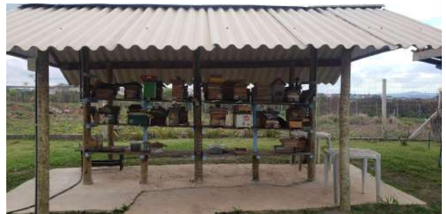
Figure 26: Poços de Caldas Campus stingless bee breeding .