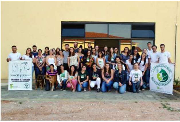
Figure 17: Muzambinho Campus 1st Wild Animals Workshop, Birds Module.