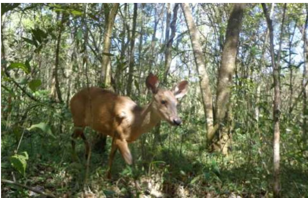
Figure 21: Inconfidentes Campus research detects large mammals in forest fragments.