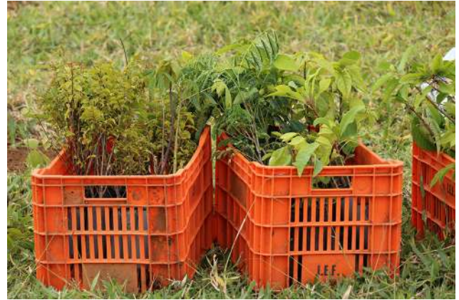
Figure 8: Muzambinho Campus seedlings of native Atlantic Forest species for the Forest Restoration Demonstration Unit.