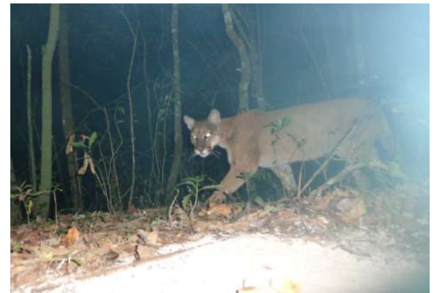
Figure 20: Inconfidentes Campus research registers the presence of Pumas and Maned Wolves in the Farm-School area.