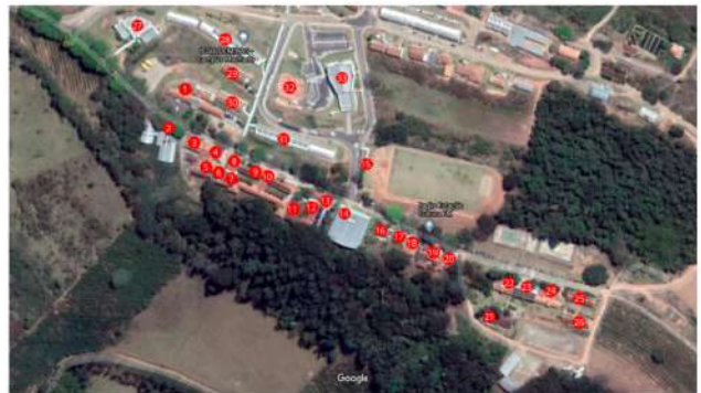
Figure 2: Machado Campus preservation of native forests.