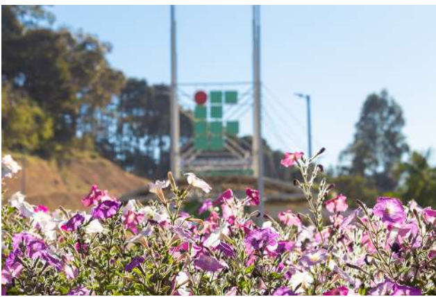
Figure 19: Muzambinho Campus promotes the benefits of landscaping in combating pandemic stress.