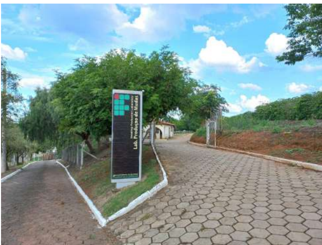
Figure 9: Muzambinho Campus Seedling Production Laboratory.