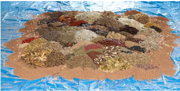
Figure 7: Muzambinho Campus seeds of native Atlantic Forest species for the Forest Restoration Demonstration Unit.