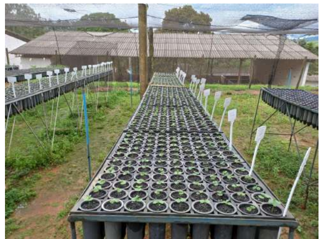
Figure 10: Muzambinho Campus seedling production greenhouse.