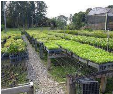
Figure 1: Machado Campus native seedling nursery in partnership with the State Forest Institute (IEF).