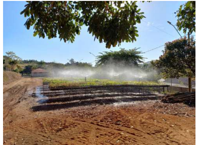
Figure 12: Muzambinho Campus seedling production.