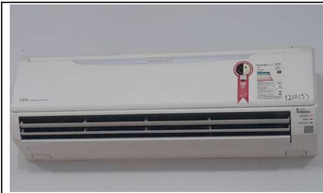
Figure 1: Campus Muzambinho efficient air conditioning.