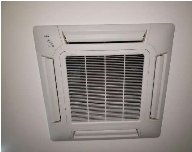
Figure 7: Rectory efficient air conditioning.