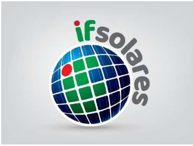
Figure 13: IFSULDEMINAS is selected in public call with solar power project.