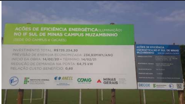
Figure 15: Campus Muzambinho replacement of lighting for conventional lamps by LED lamps.