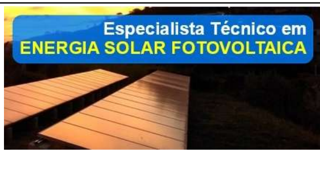
Figure 20: Poços de Caldas Campus Technical Specialist Course in Photovoltaic Solar Energy .