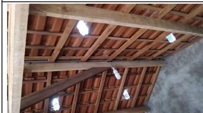
Figure 19: Inconfidentes Campus natural lighting with pet bottles filled with water.