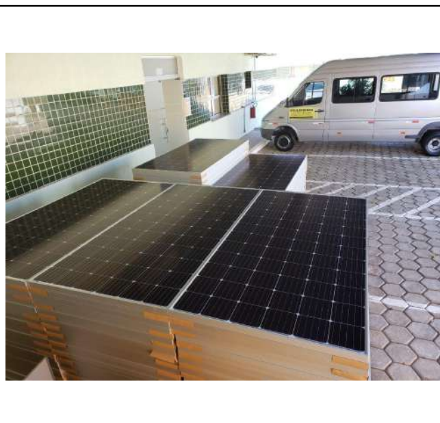
Figure 18: Rectory new photovoltaic plates to be installed.