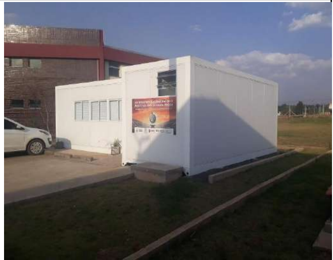
Figure 8: Campus Poços de Caldas Energy Efficiency and Renewable Energy laboratory (LEFEER).