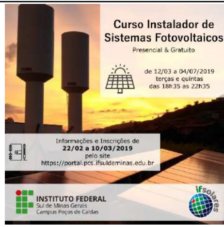
Figure 12: Campus Poços de Caldas Photovoltaic Systems Installer course in Initial and Continuing Education (FIC).