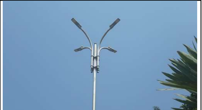
Figure 16: Campus Muzambinho new LED lamps.