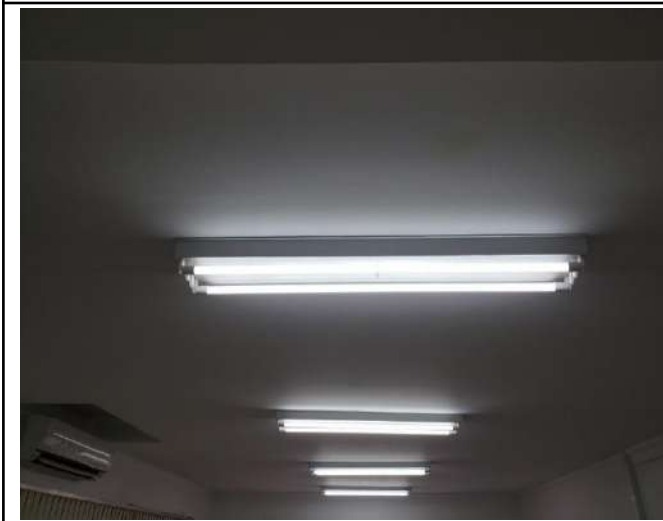
Figure 3: Rectory LED tubular lights.