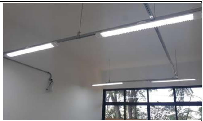
Figure 2: Campus Muzambinho LED tubular lights.