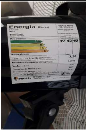
Figure 5: Campus Carmo de Minas efficient ventilator.