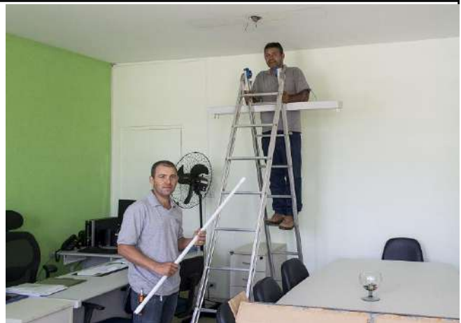
Figure 10: Campus Inconfidentes replacing the lighting in the main building.