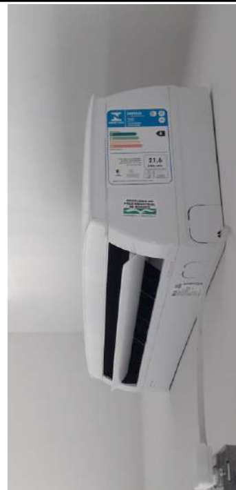
Figure 6: Campus Carmo de Minas efficient air conditioning.