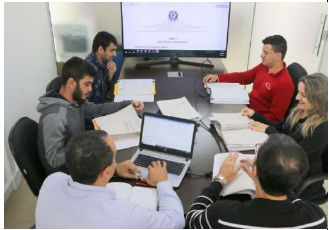
Figure 14: IFSULDEMINAS renewable energy bidding expertise.