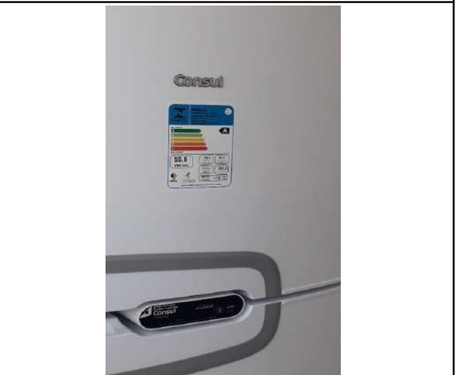
Figure 4: Campus Carmo de Minas efficient refrigerator.