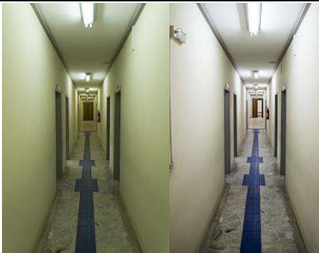
Figure 9: Campus Inconfidentes previous lighting compared to new LED lighting.