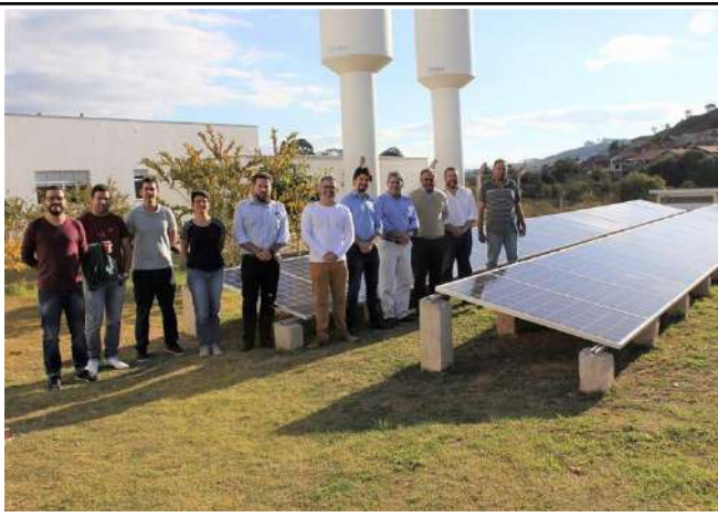
Figure 11: IFSULDEMINAS and DME celebrate results of the first phase of the “IF Solares” Project.