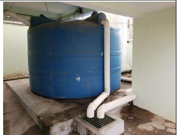
Figure 8: Rectory rainwater recovery system for covering the flushing and irrigation – Water storage tank.