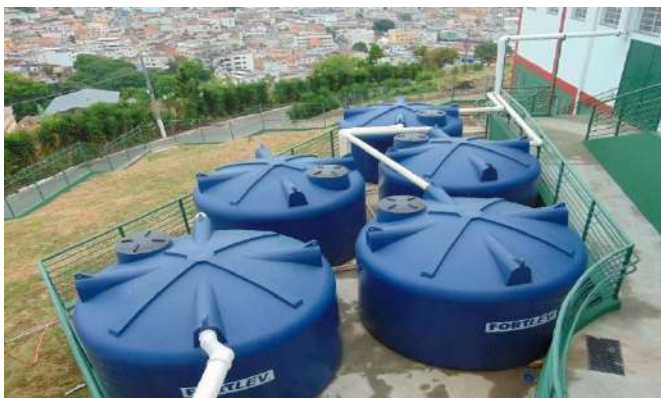
Figure 7: Campus Três Corações rainwater recovery system for covering the flushing and irrigation – Water storage tanks.