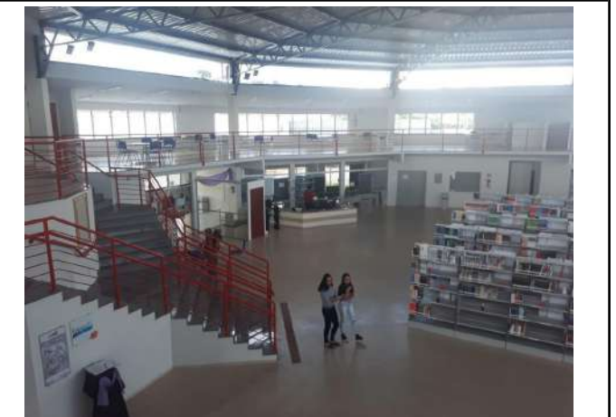
Figure 16: Campus Poços de Caldas passive systems for natural light exploitation – Library lighting.