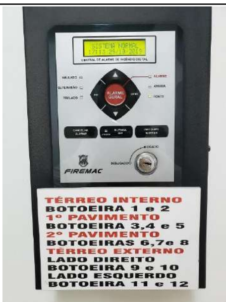
Figure 3: Rectory fire-fighting system – Fire alarm.