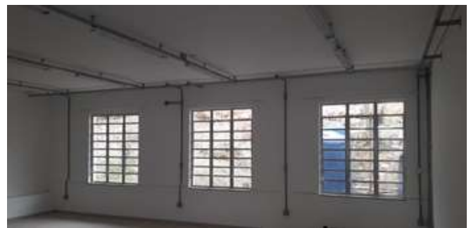
Figure 26: Carmo de Minas Campus passive system for natural light exploitation.