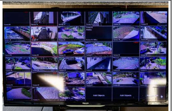
Figure 20. Inconfidentes Campus video surveillance system – Camera control.