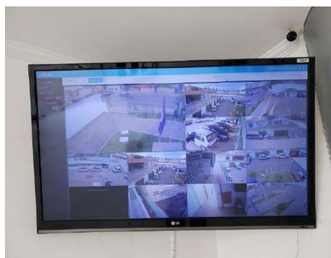
Figure 4: Rectory video surveillance system – Camera control.