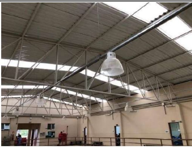
Figure 17: Campus Pouso Alegre passive systems for natural light exploitation – Engineering building.