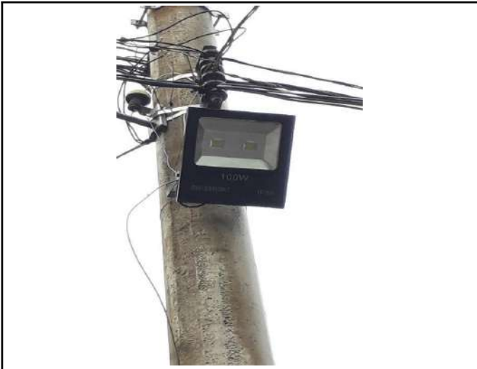
Figure 11: Campus Carmo de Minas high-efficiency luminaires with automatic lighting control – LED lamp post.