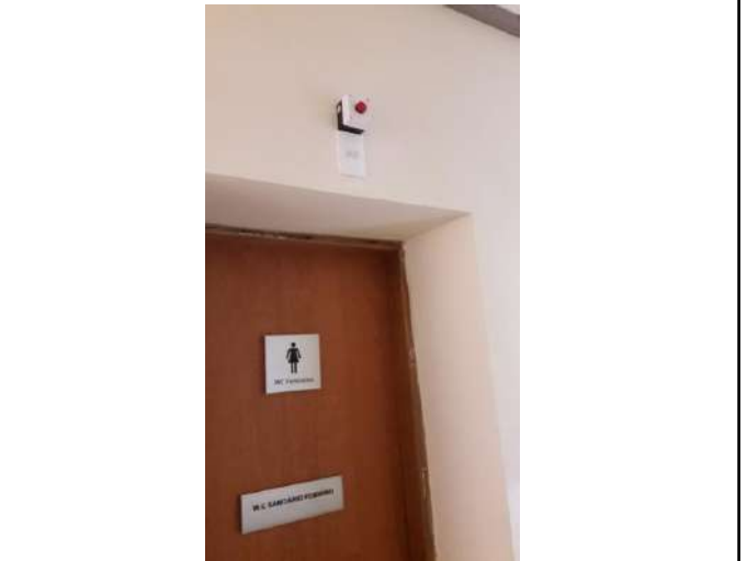
Figure 14: Campus Inconfidentes high-efficiency luminaires with automatic lighting control – Presence sensor.