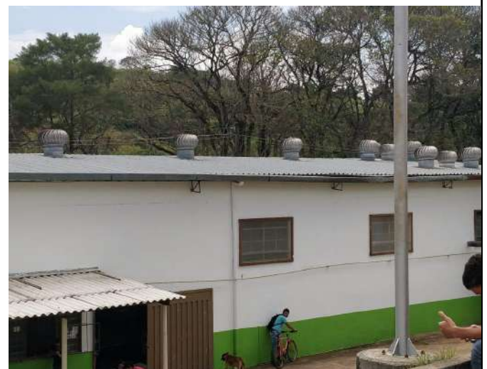
Figure 10: Campus Machado passive cooling and/or exploitation/limitation systems for free supplies – Coffee roasting building exhausters.