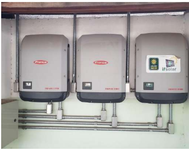
Figure 5: Rectory automatic management system for energy supplies and production – Solar power converters.