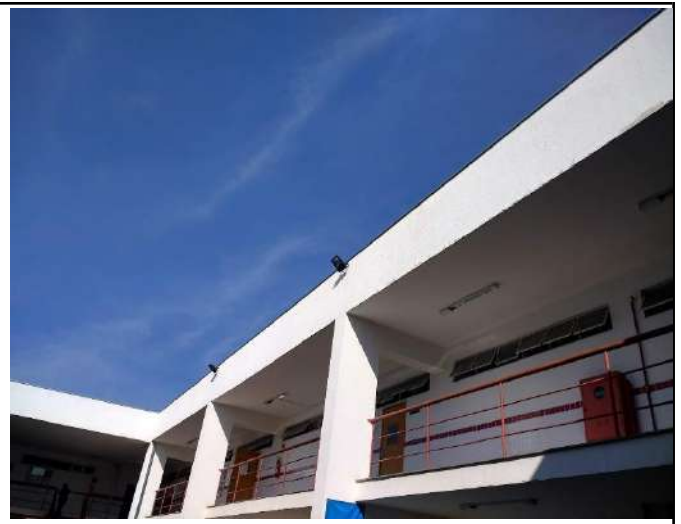
Figure 12: Campus Poços de Caldas high-efficiency luminaires with automatic lighting control – LED spotlights.