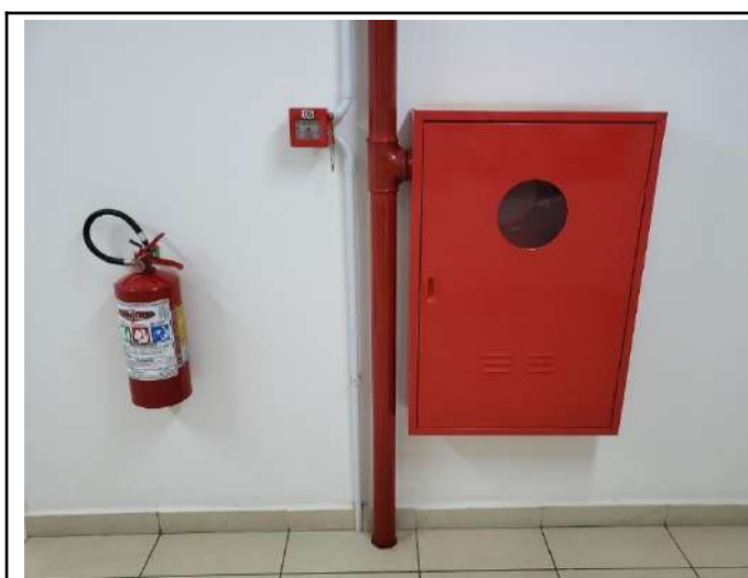
Figure 1: Rectory fire-fighting system – Fire extinguisher and fire hose.