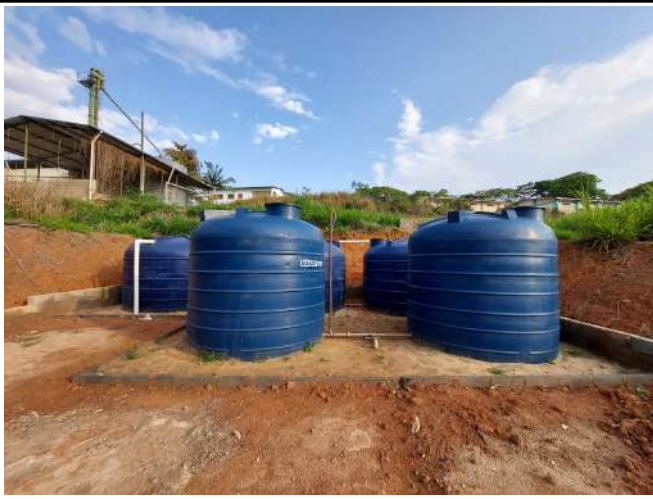
Figure 23: Machado Campus rainwater catchment system for swine sector cleaning.