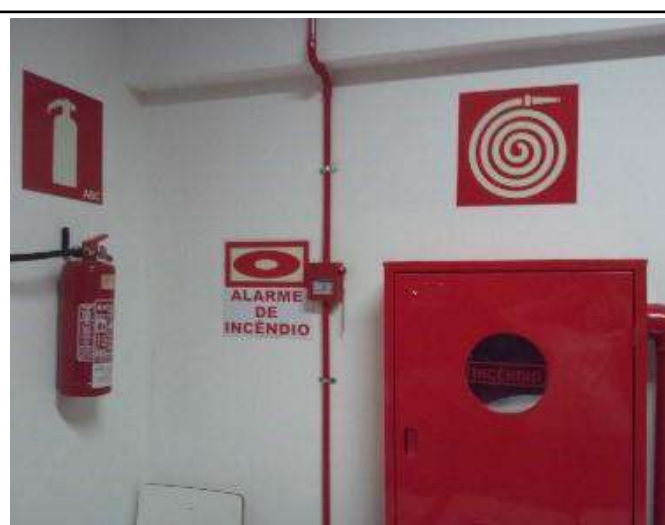
Figure 1: Campus Passos fire-fighting system – Fire extinguisher, fire hose and fire alarm.