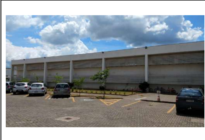
Figure 15: Campus Poços de Caldas shielding adjustment and solar control – Brise-soleil at classroom building.