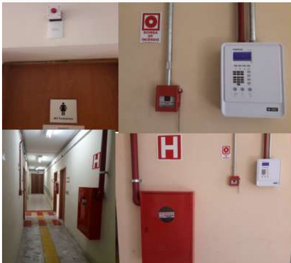
Figure 21. Inconfidentes Campus motion detector and fire-fighting system.