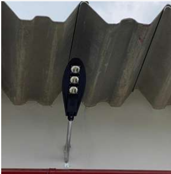
Figure 25: Carmo de Minas Campus lamp with photocell sensor.