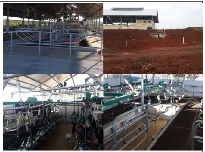
Figure 18: Campus Muzambinho monitoring of environmental parameters related to thermo-hygrometric comfort – Dairy cattle free stall. Available at: https://www.muz.ifsuldeminas.edu.br/pqvida/2200-programa-qualidade-de-vida-importancia-do-conforto-animal-na-producao-leiteira .