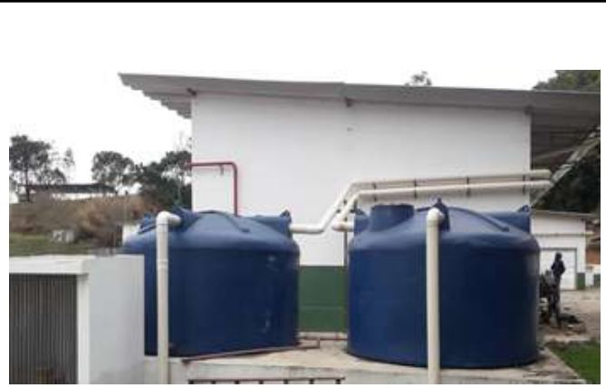
Figure 24: Carmo de Minas Campus rainwater catchment system