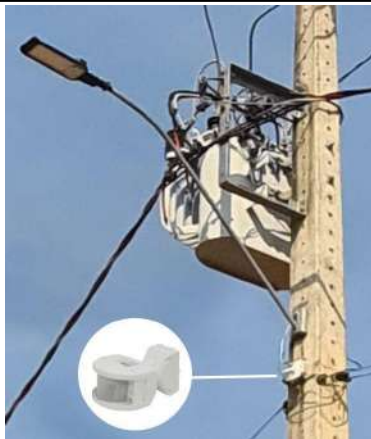
Figure 19: Machado Campus motion detectors installed on street lights.