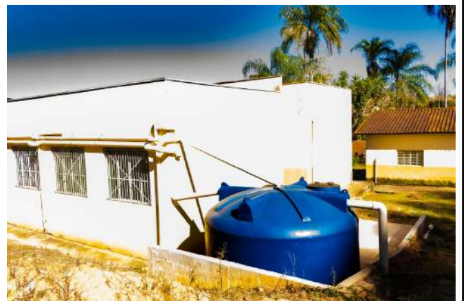
Figure 22: Inconfidentes Campus rainwater recovery system.