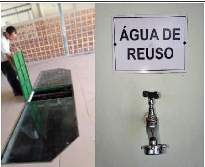
Figure 9: Rectory rainwater recovery system for covering the flushing and irrigation – Water storage tank and reuse water tap.