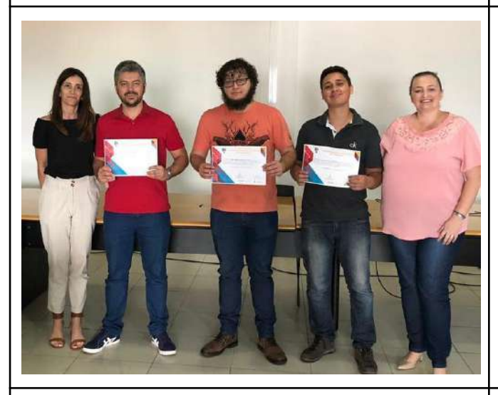
Figure 3: Poços de Caldas Campus – Automation of parking management using Arduino technologies.