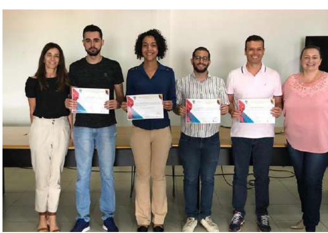
Figure 4: Muzambinho Campus – Gratified Carpool application.