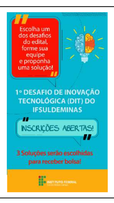
Figure 2: IFSULDEMINAS <u>1st Technological Innovation</u> <u>Challenge</u>.