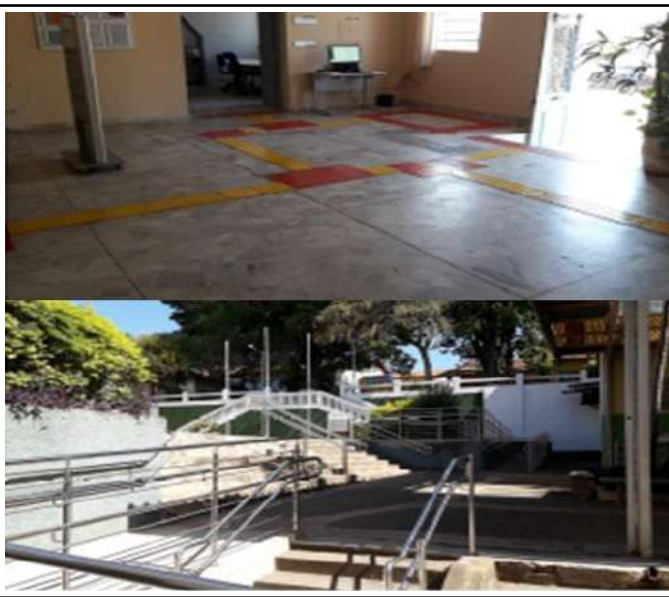
Figure 8: Inconfidentes Campus tactile paving, ramp and handrails.