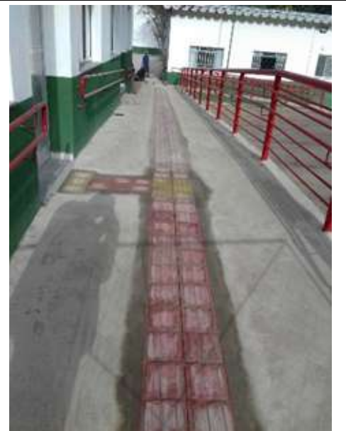
Figure 4: Carmo de Minas Campus tactile paving and handrails.