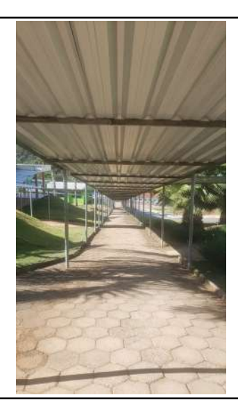
Figure 6: Machado Campus covered sidewalk.