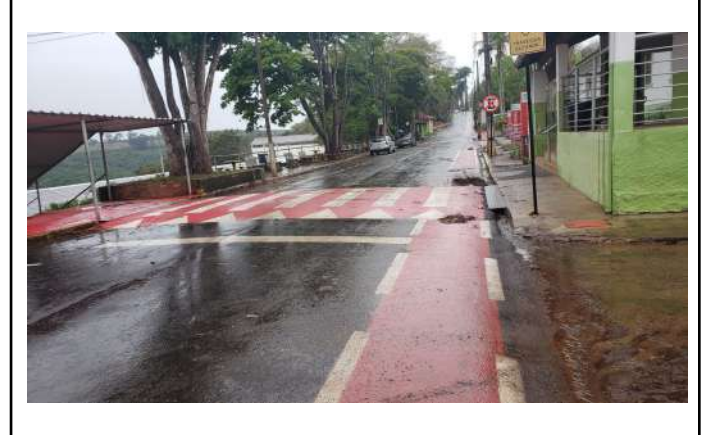
Figure 15: Machado Campus elevated walkway.