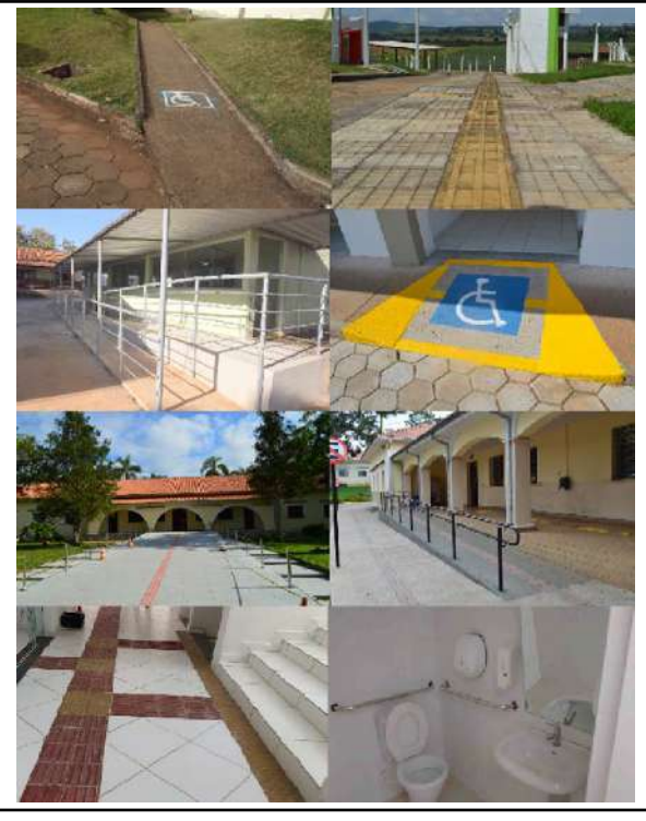
Figure 10: IFSULDEMINAS works carried out to suit and include people with disabilities.