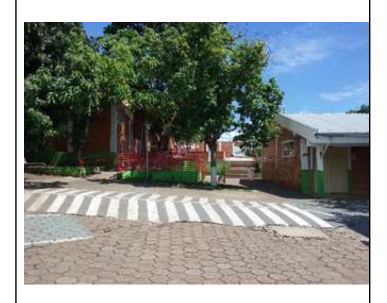
Figure 11: Passos Campus elevated crosswalk.