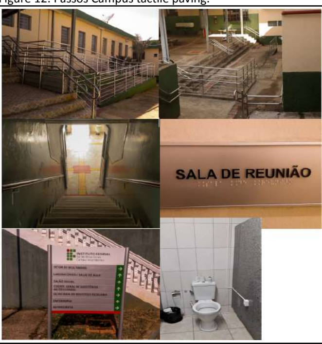
Figure 14: Inconfidentes Campus tactile paving, ramp, handrails, Braille nameplates and bathroom for people with disabilities.