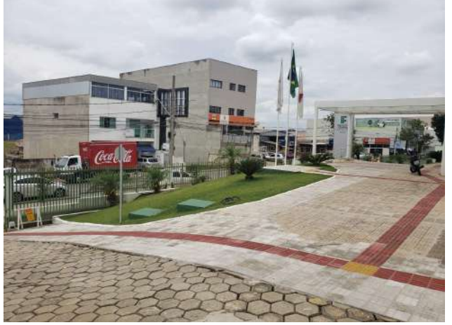
Figure 16: Rectory new tactile paving.