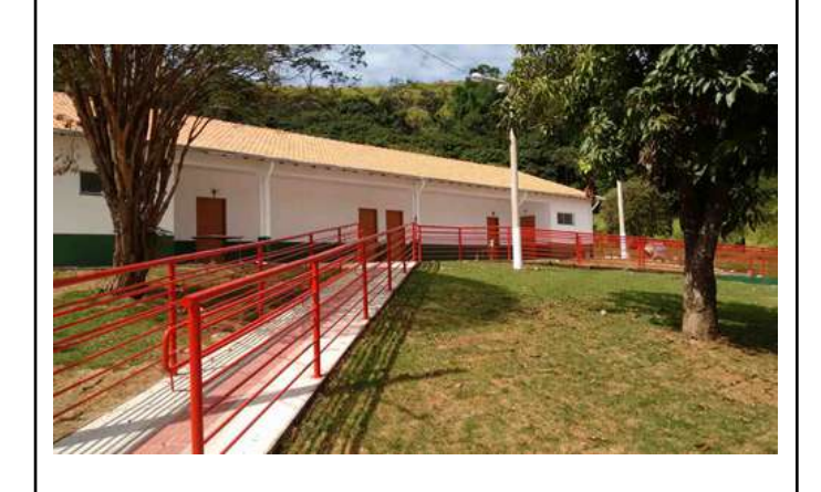
Figure 5: Carmo de Minas Campus tactile paving and handrails.