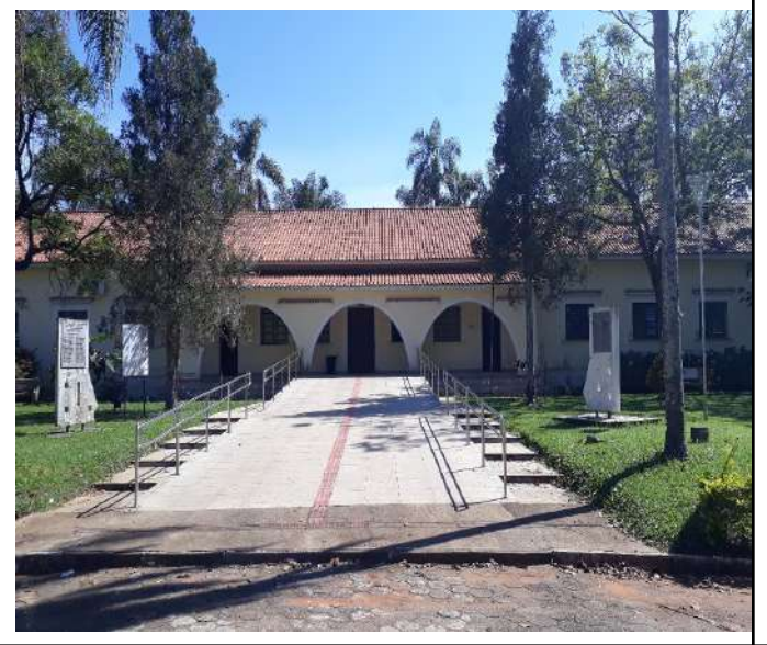
Figure 7: Muzambinho Campus tactile paving, ramp and handrails.