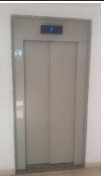
Figure 3: Rectory elevator.