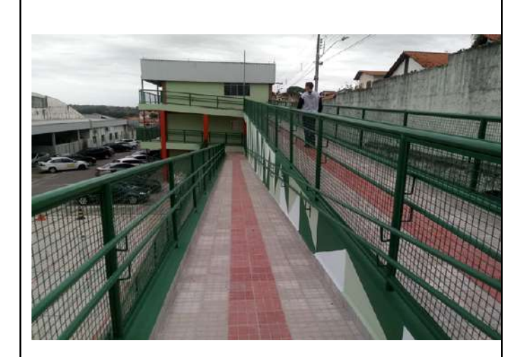
Figure 9: Três Corações Campus tactile paving, ramp and handrails.