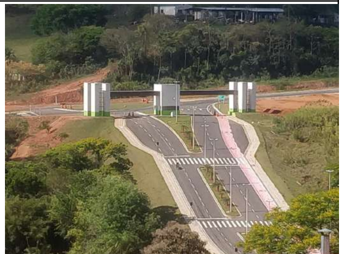
Figure 4: Machado Campus new road junction with cycle way.