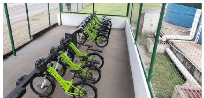
Figure 12: Poços de Caldas Campus electric bicycles rack.