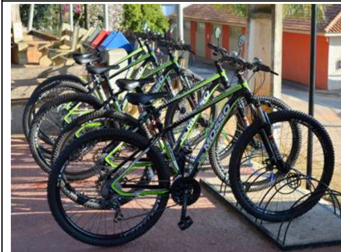
Figure 3: Machado Campus bicycles available for free.