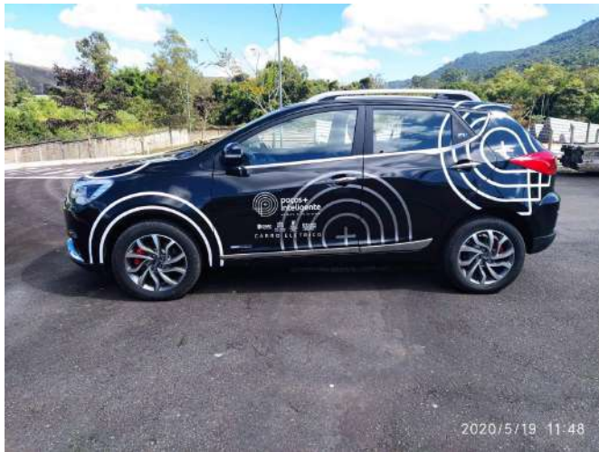
Figure 9: Poços de Caldas Campus electric vehicle - Electric Mobility Project.