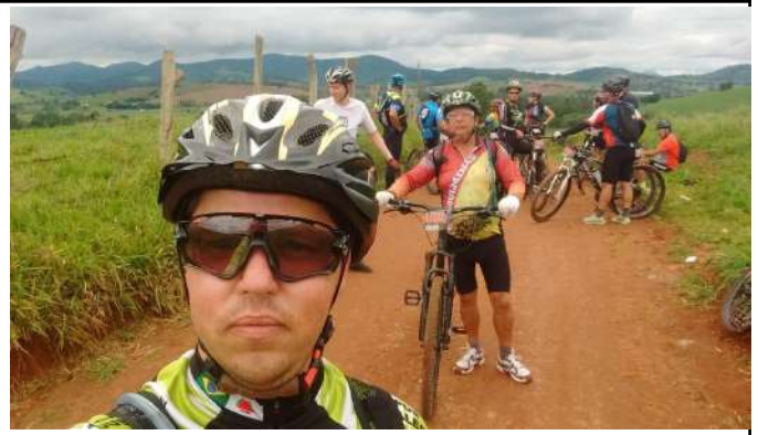
Figure 6: Pouso Alegre Campus bike group.