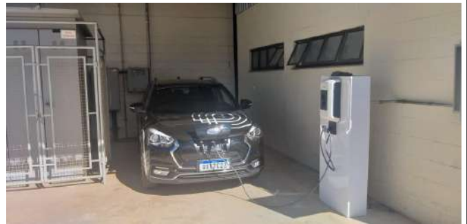
Figure 10: Poços de Caldas Campus electric vehicle and vehicle charger.