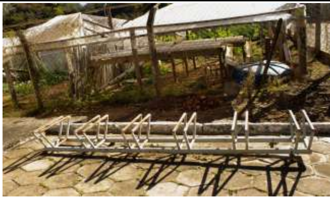
Figure 5: Inconfidentes Campus bicycle rack.