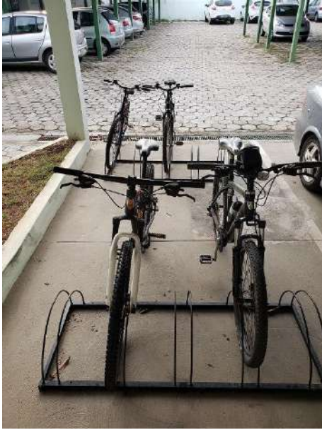
Figure 7: Rectory bicycle rack.