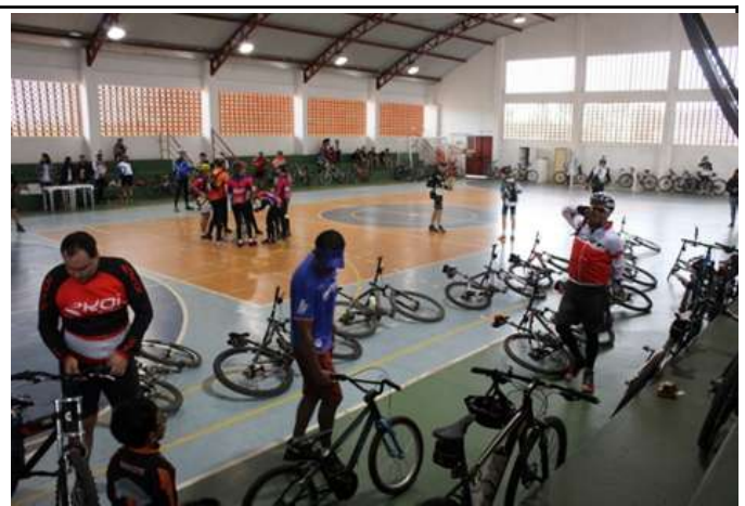
Figure 2: Poços de Caldas Campus cycle tour.