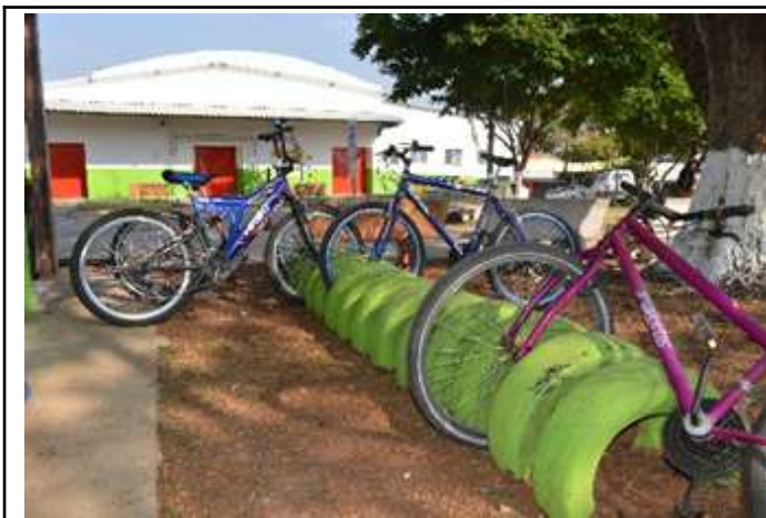
Figure 1: Passos Campus bicycle rack built with tires.