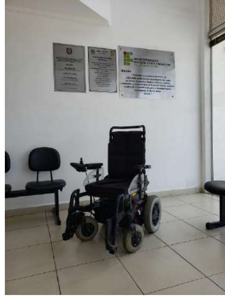
Figure 8: Rectory electric wheelchair.