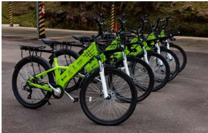
Figure 11: Poços de Caldas Campus electric bikes.