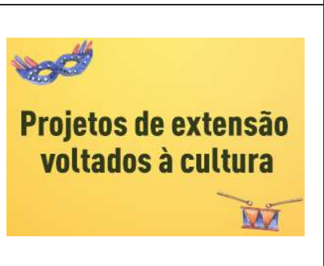
Figure 4: IFSULDEMINAS Selection of Extension projects focused on Culture.