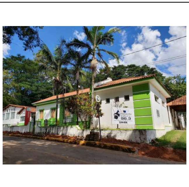
Figure 10: Machado Campus Culture FM Radio Station .