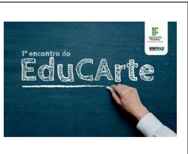
Figure 2: IFSULDEMINAS EduCARte Study Group (Education, Knowledge and Art) starts activities.