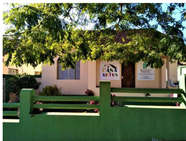
Figure 6: Inconfidentes Campus House of Arts .