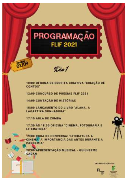
Figure 7: Pouso Alegre Campus FLIF – Literary Festival .