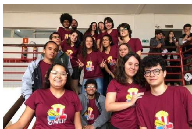
Figure 8: Pouso Alegre Campus Cine IF .