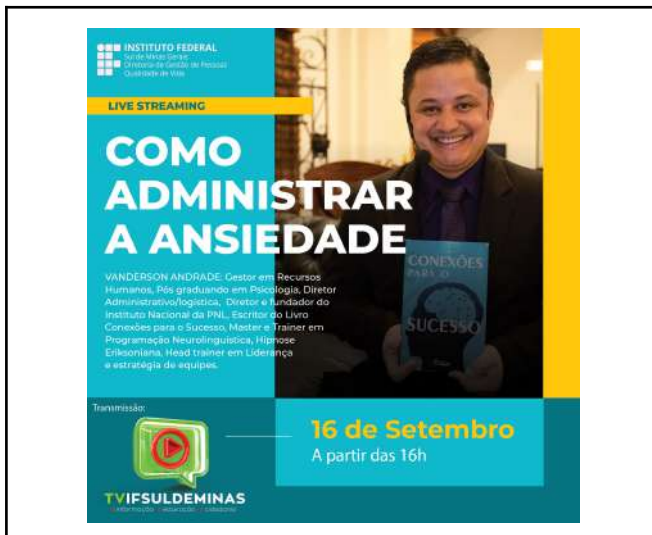
Figure 1: IFSULDEMINAS Quality of Life Coordination Lives on several subjects.