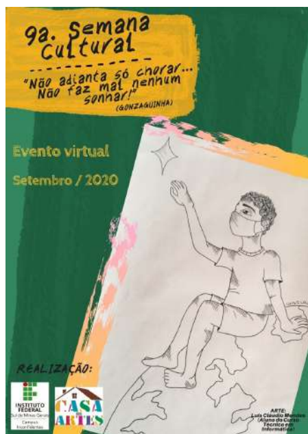
Figure 5: Inconfidentes Campus 9th Cultural Week .