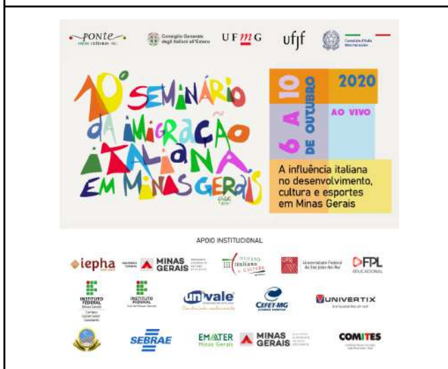
Figure 3: IFSULDEMINAS 10th Seminar on Italian Immigration in MG support.