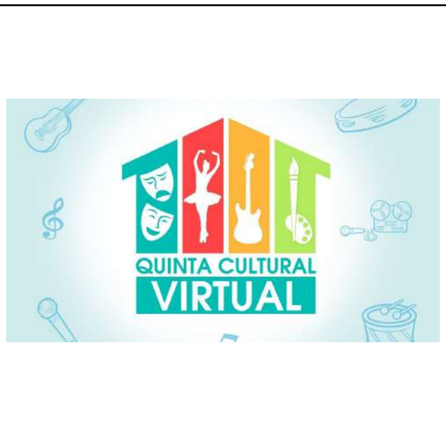
Figure 12: Muzambinho Campus Virtual Cultural Thursday .