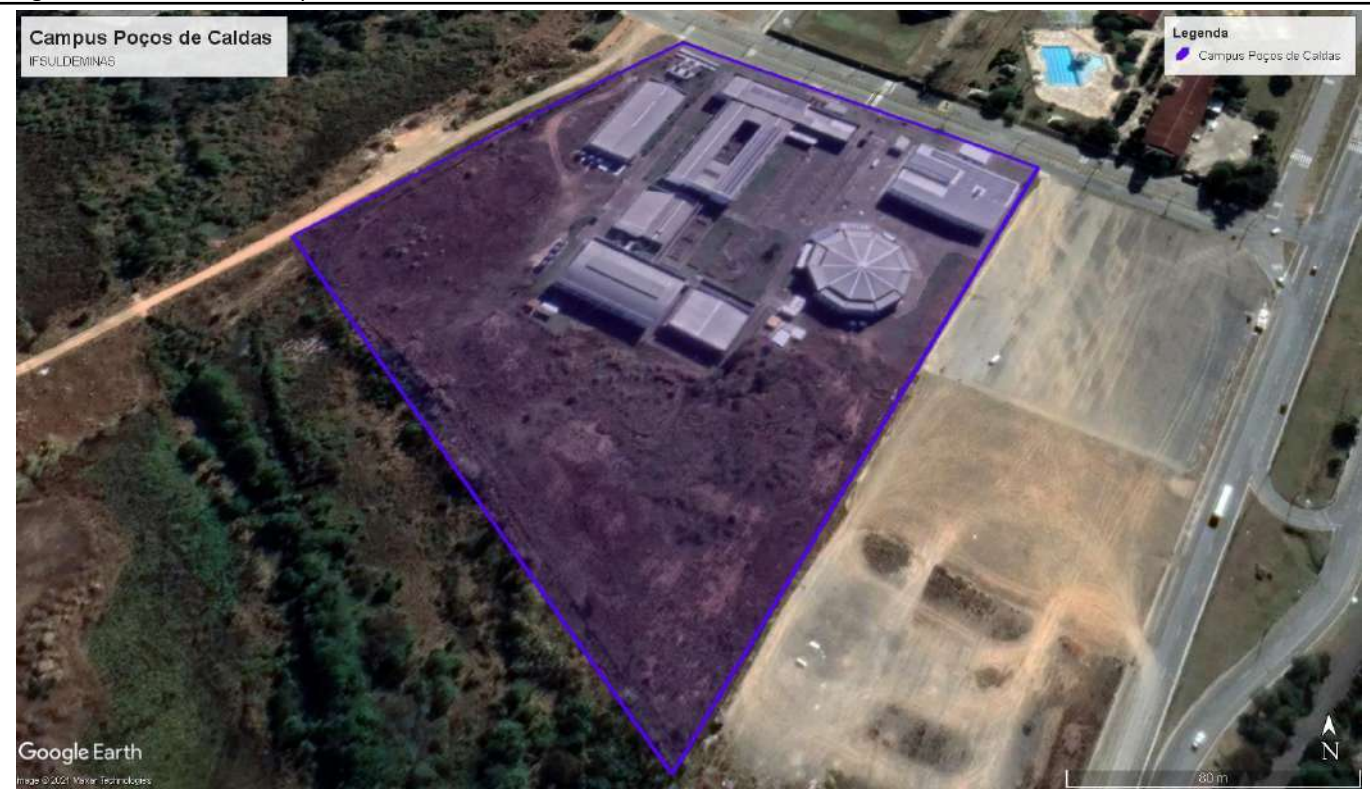
Figure 5: Poços de Caldas Campus.