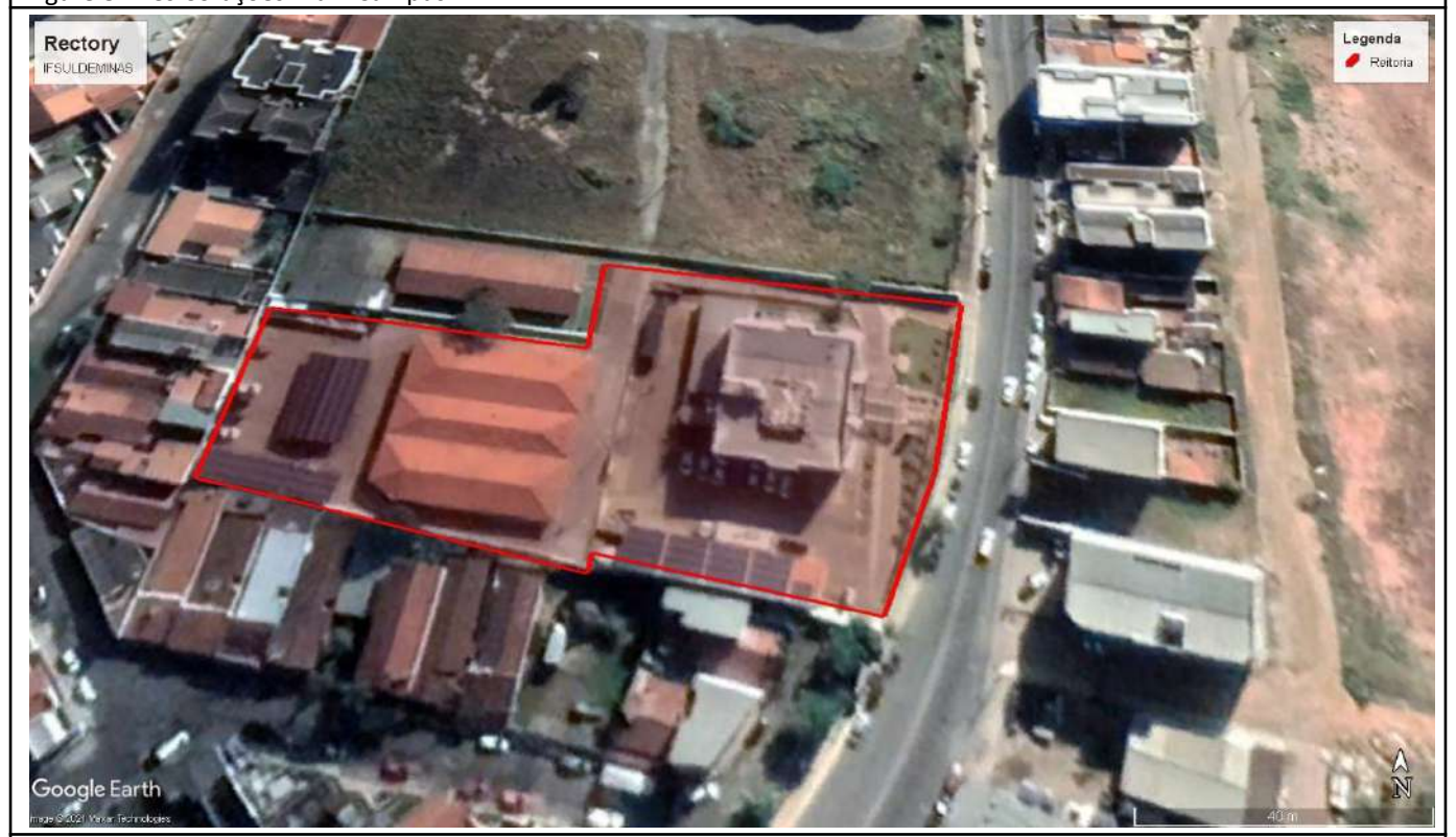
Figure 9: IFSULDEMINAS Rectory.