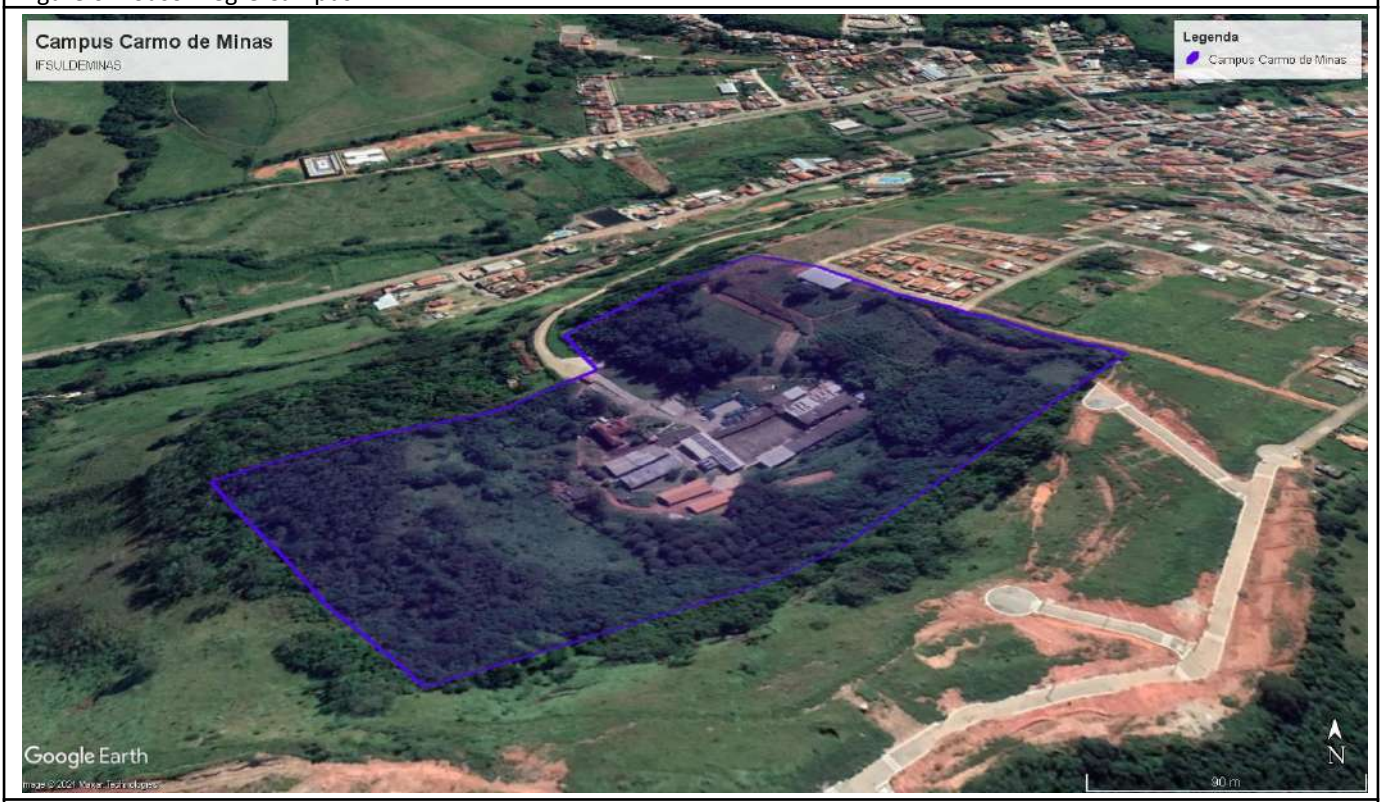
Figure 7: Carmo de Minas Campus.