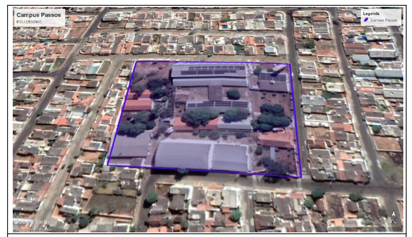
Figure 4: Passos Main Campus.