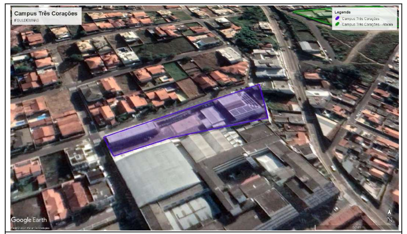
Figure 8: Três Corações Main Campus.