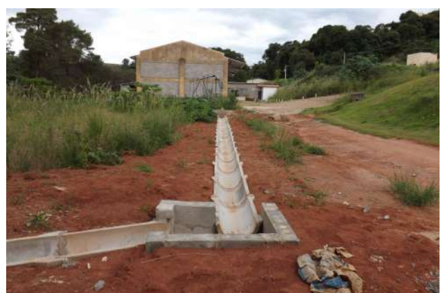
Figure 8: Machado Campus streets drainage.