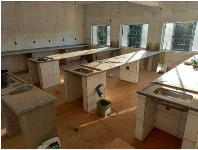
Figure 35: Inconfidentes Campus renovation of the Environmental Laboratory.