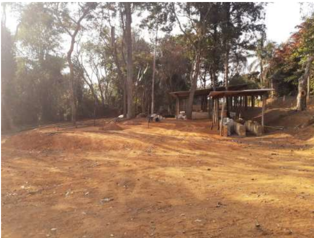
Figure 15: Machado Campus restructuring of native seedling nurseries and earthworms.