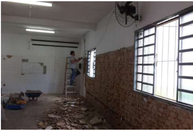
Figure 17: Machado Campus renovation of the Zoology Laboratory.