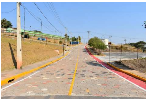
Figure 3: Machado Campus reform of street blocks.