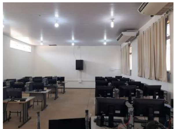
Figure 2: Machado Campus internal paintings.