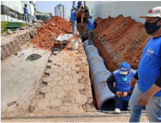
Figure 29: Rectory renovation of the drainage system.