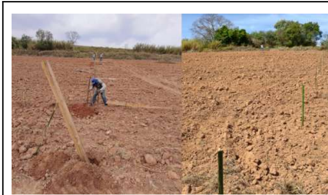
Figure 47: Inconfidentes Campus construction and planting of the new fruit sector.