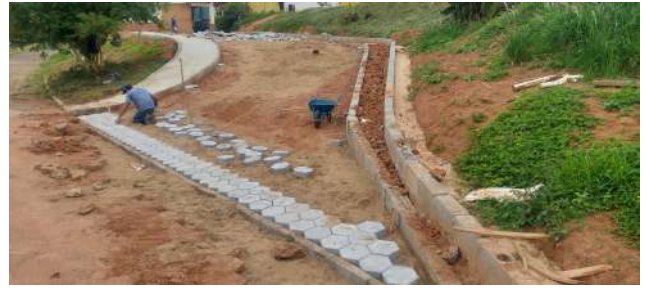
Figure 42: Machado Campus sidewalk in the poultry sector.