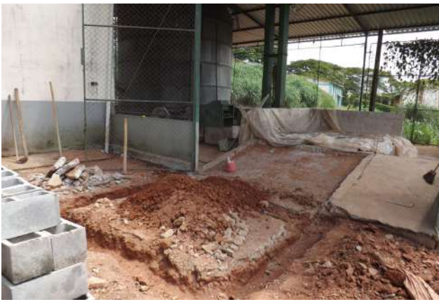
Figure 13: Machado Campus Feed Factory improvements.