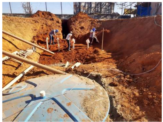
Figure 20: Machado Campus implementation of the Sewage treatment system of the Coffee Center of Excellence.