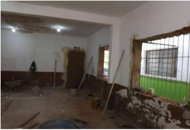
Figure 5: Machado Campus renovation of the Nursing Laboratory.