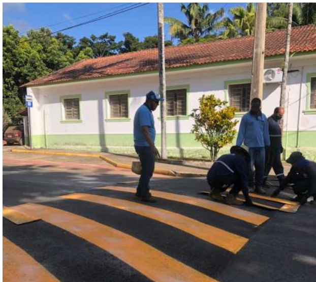
Figure 9: Machado Campus road signage.