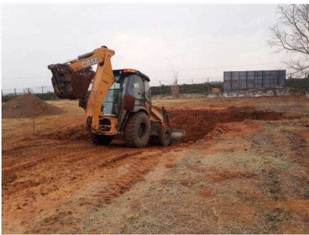
Figure 19: Machado Campus implementation of the Sewage treatment system of the Coffee Center of Excellence.