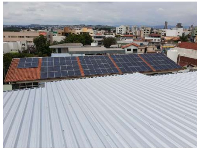
Figure 28: Rectory roof renovation.