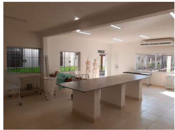
Figure 6: Machado Campus renovation of the Nursing Laboratory.