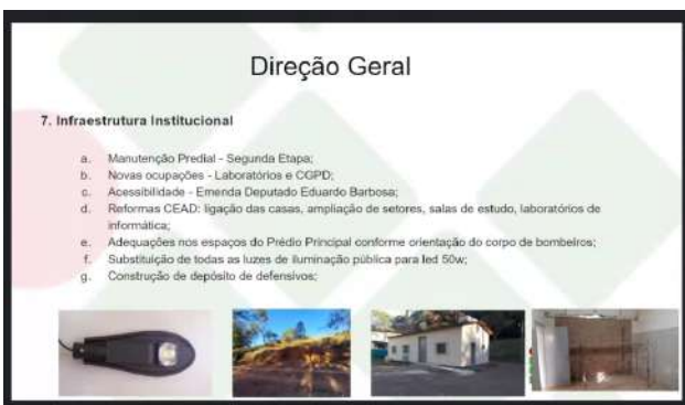
Figure 33: Inconfidentes Campus maintenance plan, renovation and construction of new facilities.