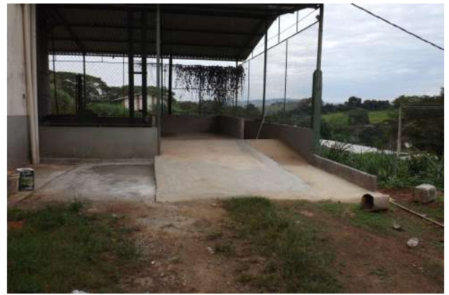
Figure 14: Machado Campus Feed Factory improvements.