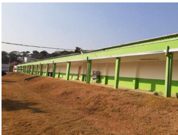
Figure 1: Machado Campus external paintings.