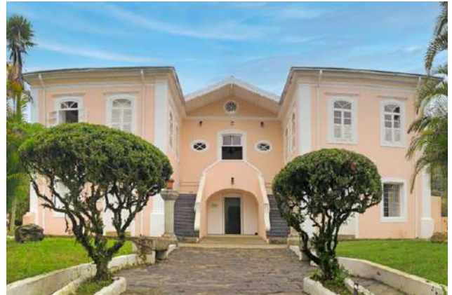
Figure 26: Carmo de Minas Campus Casarão old mansion renovated with its original architecture.