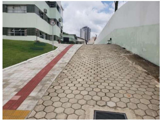
Figure 30: Rectory renovation of the drainage system.