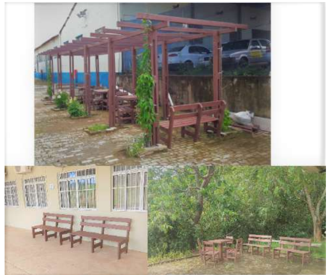
Figure 46: Inconfidentes Campus installation of bioresin furniture.