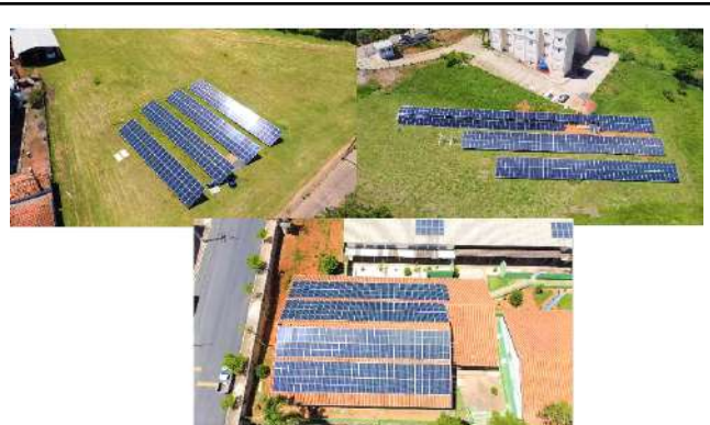
Figure 48: Inconfidentes Campus installation of new photovoltaic panels.