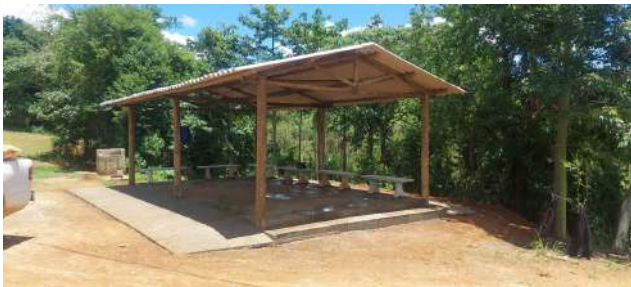
Figure 39: Structure to accommodate students in the garden sector.