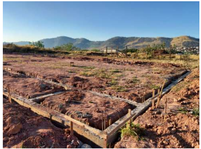
Figure 36: Inconfidentes Campus construction of a new teaching block for classrooms.