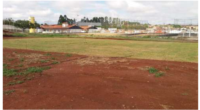
Figure 44: Passos Campus planting grass for soccer field.