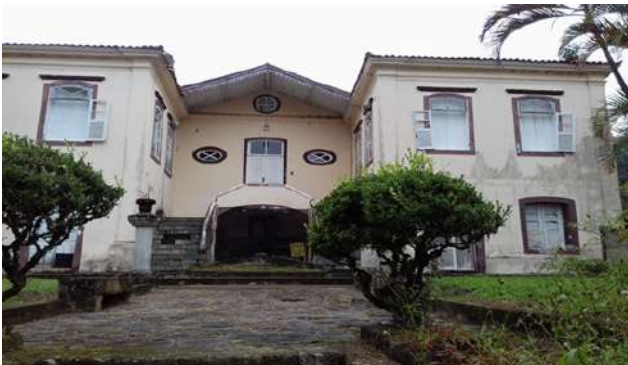
Figure 25: Carmo de Minas Campus old mansion before renovation.