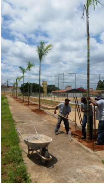
Figure 43: Passos Campus planting palm trees.