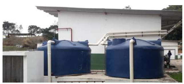
Figure 24: Carmo de Minas Campus water reservoirs connected to the rainwater collection system.