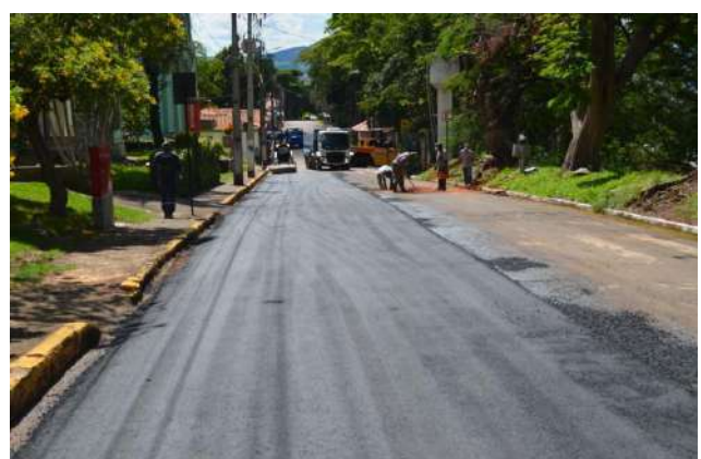
Figure 4: Machado Campus street paving refurbishment.