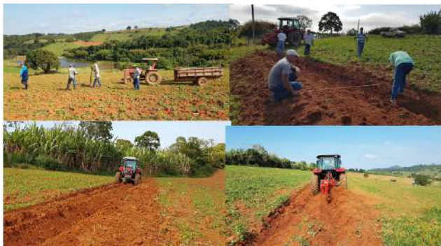
Figure 45: Inconfidentes Campus construção de curvas de nível.