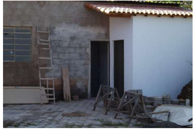
Figure 12: Machado Campus improvements in the Mechanization Sector