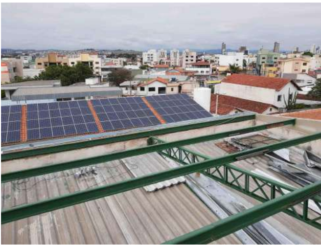
Figure 27: Rectory roof renovation.