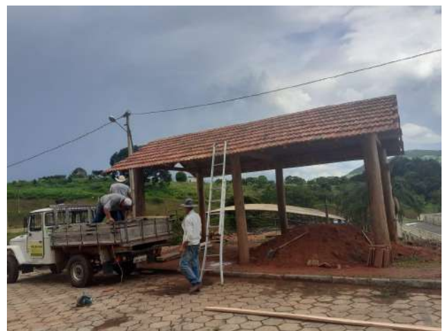
Figure 34: Inconfidentes Campus construction of living space using used materials.