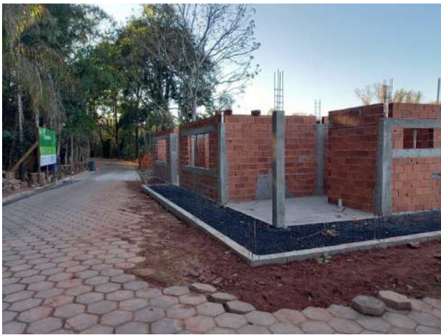
Figure 37: Inconfidentes Campus construction of the Hippotherapy Center building.