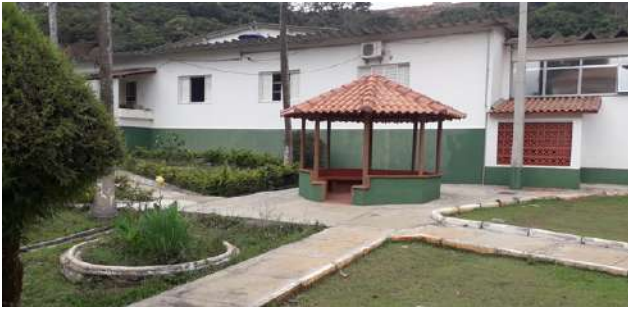
Figure 23: Carmo de Minas Campus Bandstand reformed with its original architecture.