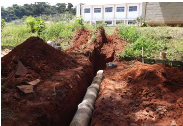
Figure 7: Machado Campus streets drainage.