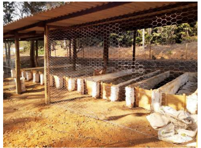
Figure 16: Machado Campus restructuring of native seedling nurseries and earthworms.