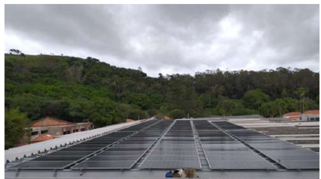
Figure 40: Carmo de Minas Campus new photovoltaic panels in the auditorium.