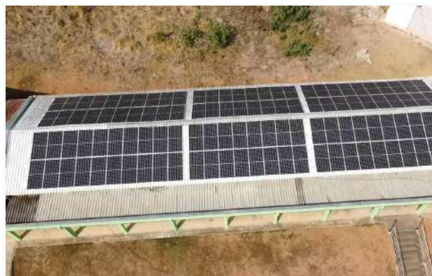
Figure 21: Machado Campus implementation of new photovoltaic modules.