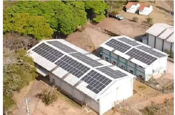
Figure 22: Machado Campus implementation of new photovoltaic modules.