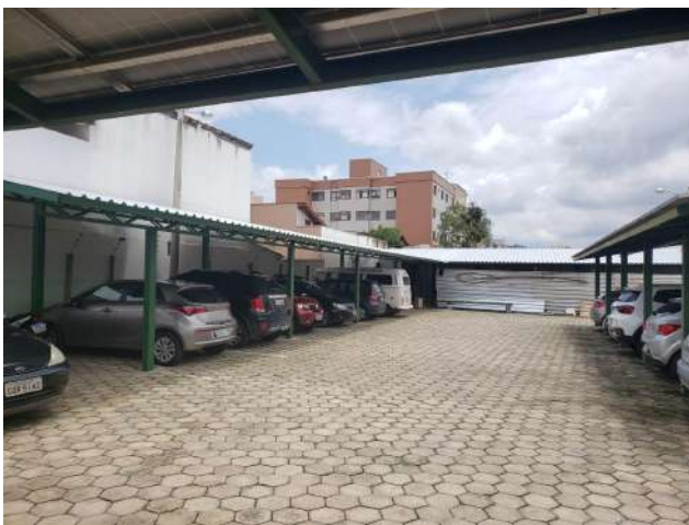
Figure 31: Rectory coverage of parking spaces.