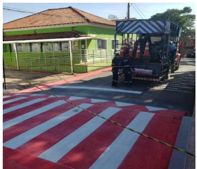
Figure 10: Machado Campus road signage.