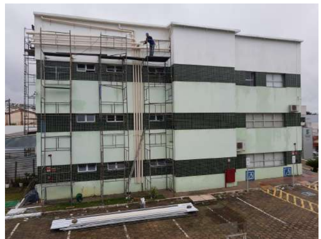
Figure 32: Rectory renovation of the rainwater collection system.