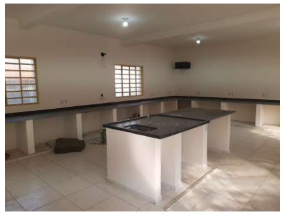
Figure 18: Machado Campus renovation of the Zoology Laboratory.