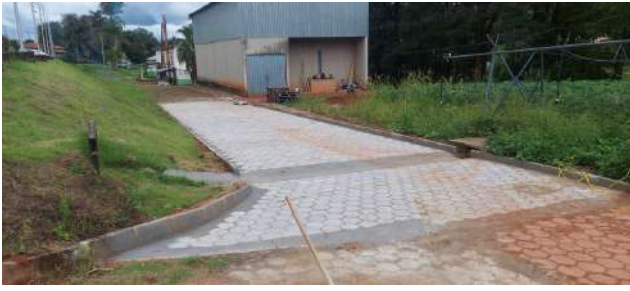
Figure 41: Machado Campus access to the roasting sector.