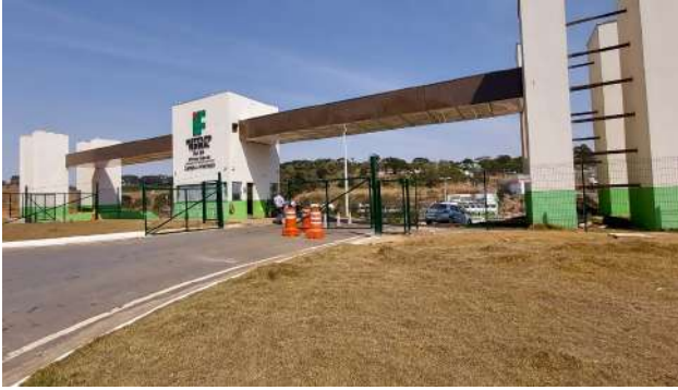
Figure 11: Machado Campus entrance closed with railings.