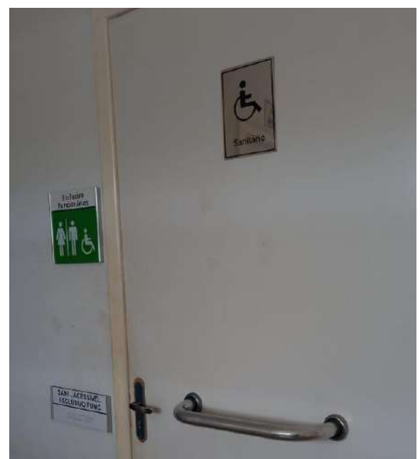
Figure 12: Pouso Alegre Campus accessible toilet for people with special needs.