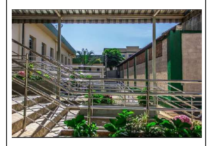
Figure 15: Inconfidentes Campus ramp and handrails.