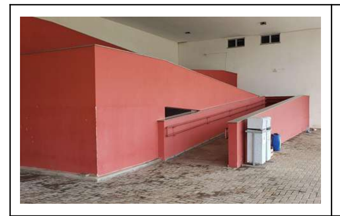
Figure 13: Poços de Caldas Campus ramp and handrails.