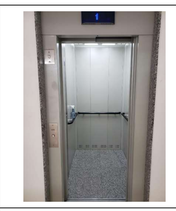
Figure 9: Rectory elevator.