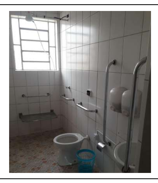
Figure 16: Inconfidentes Campus accessible toilet and shower for people with special needs.