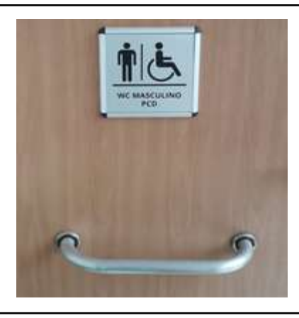
Figure 4: Machado Campus accessible toilet for people with special needs.