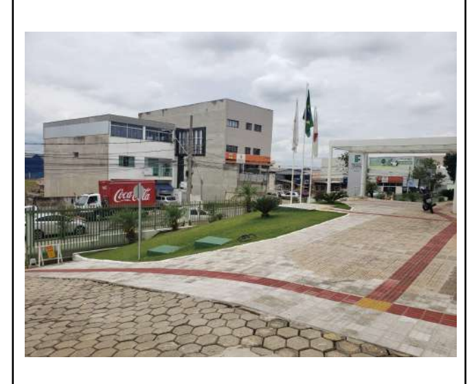
Figure 7: Rectory new tactile paving.