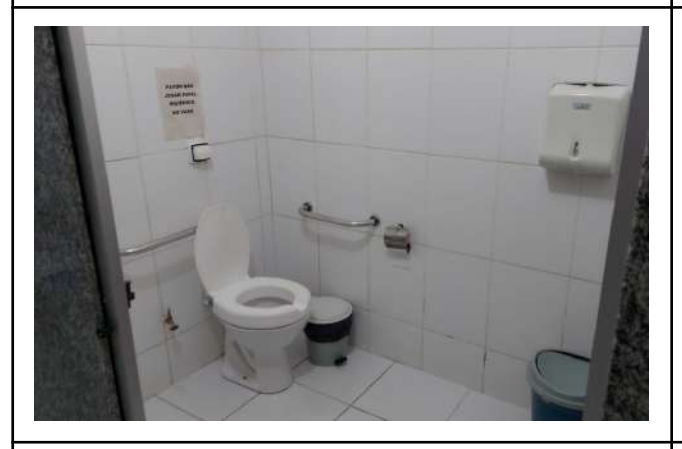
Figure 3: Machado Campus accessible toilet for people with special needs.