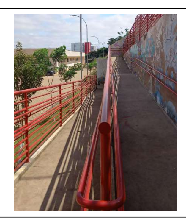
Figure 10: Pouso Alegre Campus ramp and handrails.