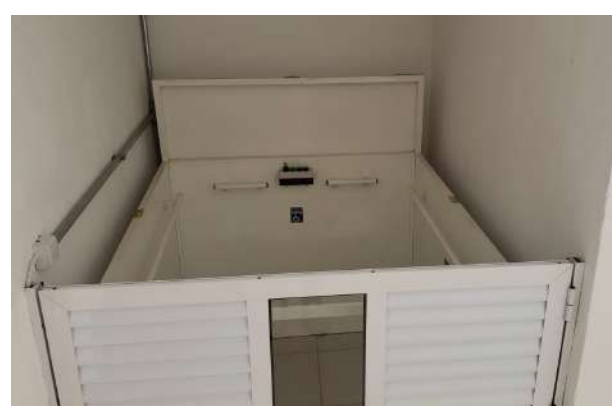
Figure 14: Poços de Caldas Campus elevator for people with special needs.