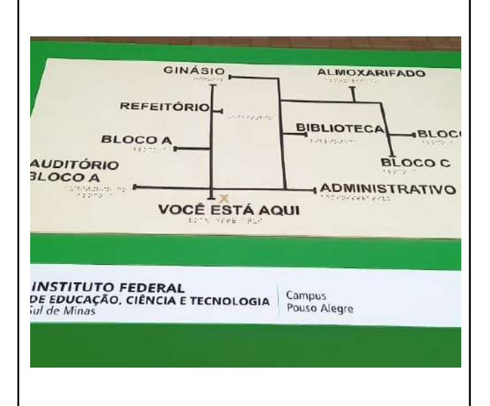
Figure 11: Pouso Alegre Campus map in braille.