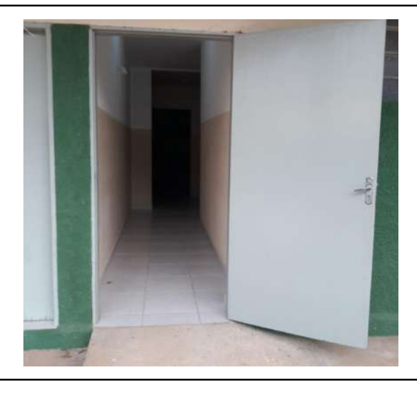
Figure 17: Inconfidentes Campus wide door in student accommodation for wheelchair passage.