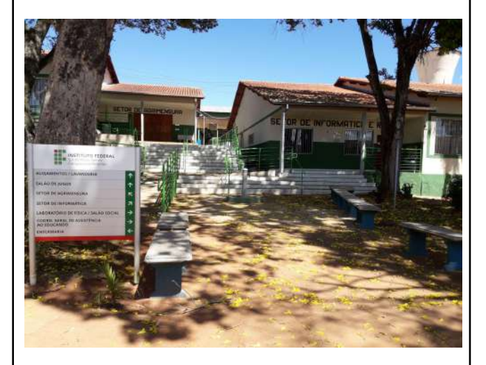
Figure 18: Inconfidentes Campus sector indication board, ramps and handrails.