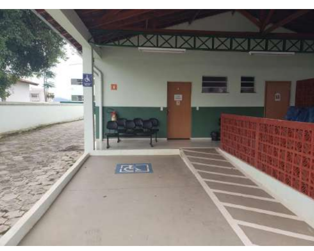
Figure 6: Rectory parking and ramp for people with special needs.