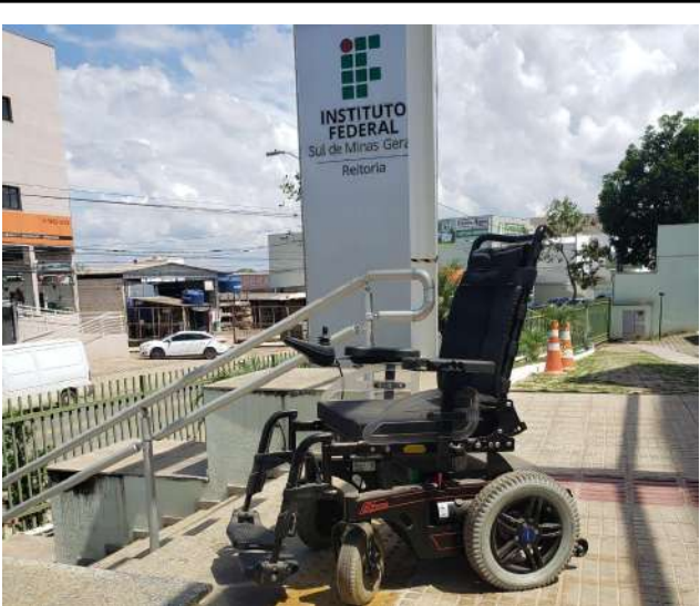
Figure 8: Rectory electric wheelchair.