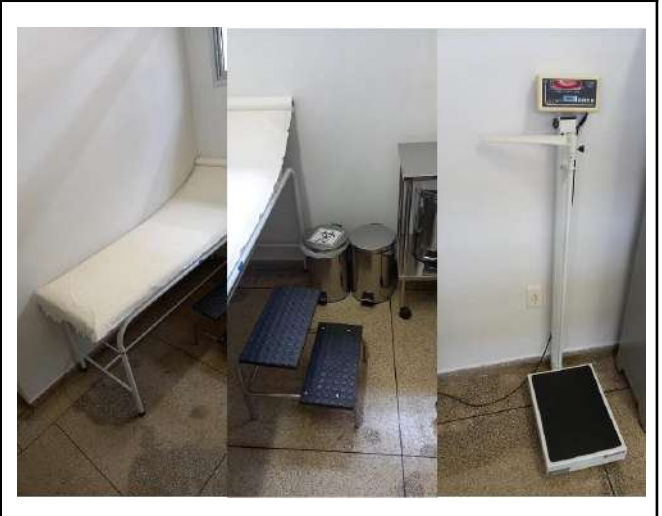
Figure 6: Pouso Alegre Campus Infirmary.