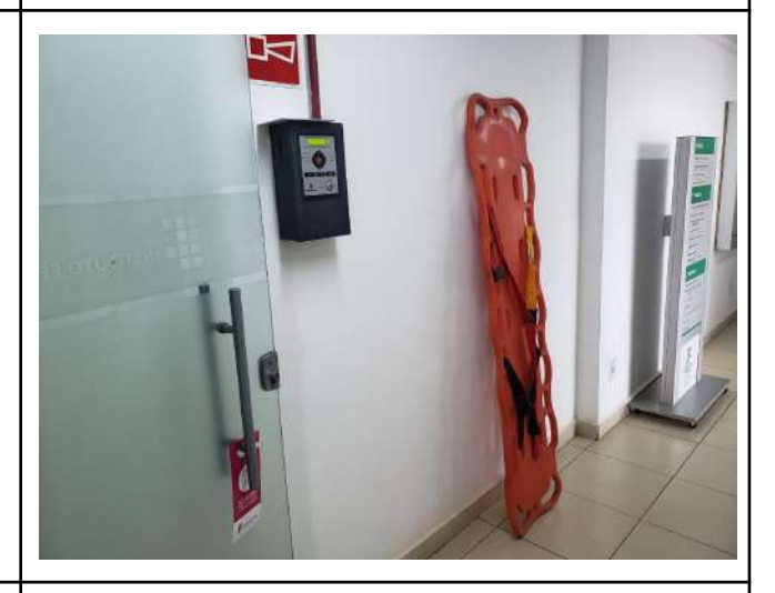
Figure 10: Rectory rescue immobilizer stretcher.