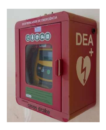
Figure 7: Pouso Alegre Campus emergency defibrillator.