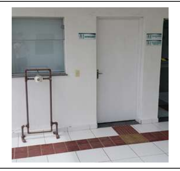
Figure 11: Poços de Caldas Campus Infirmary.