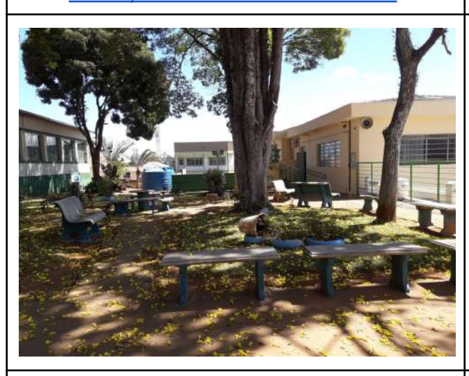
Figure 15: Inconfidentes Campus wooded living area.