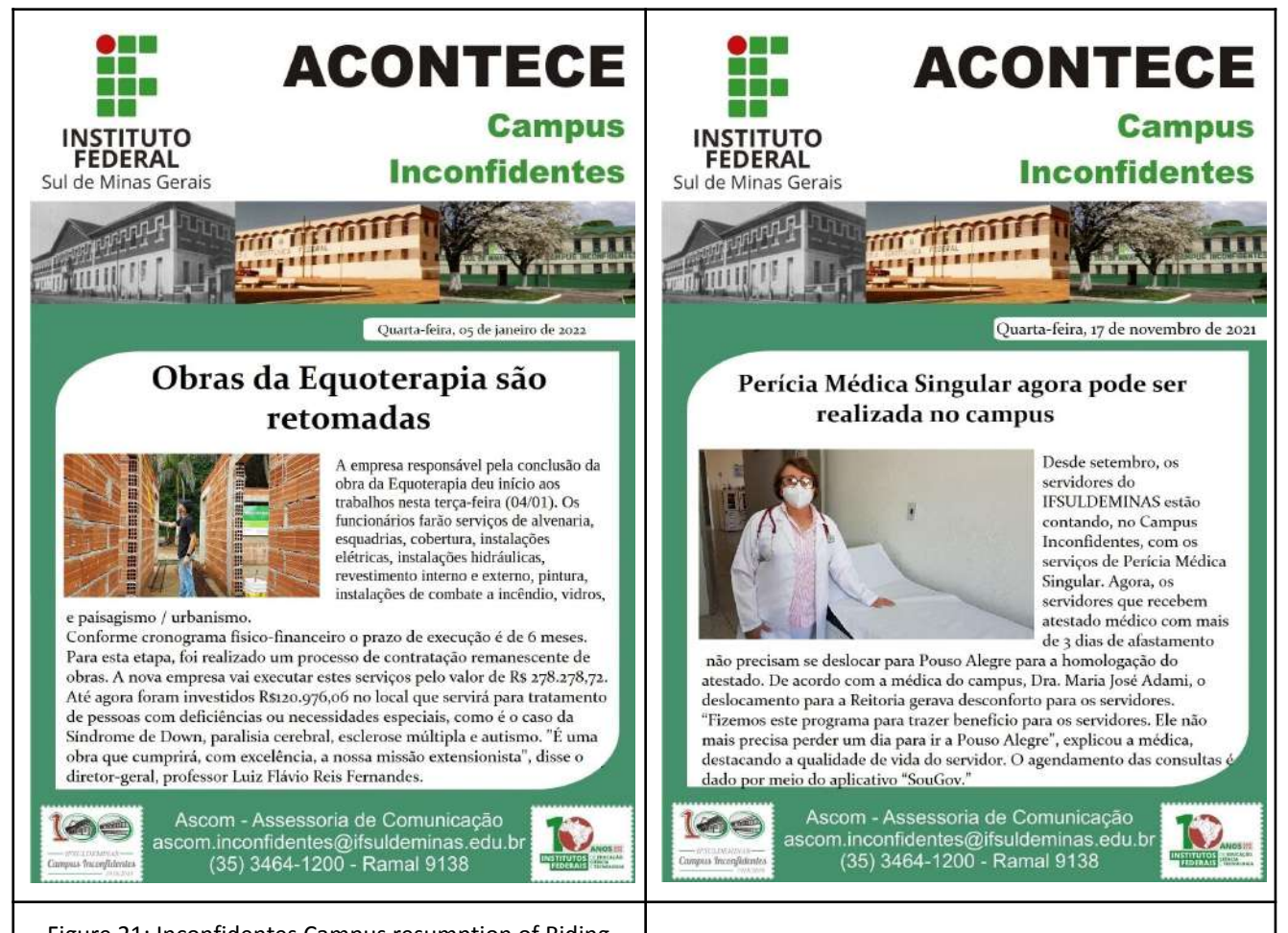
Figure 21: Inconfidentes Campus resumption of Riding Therapy works.