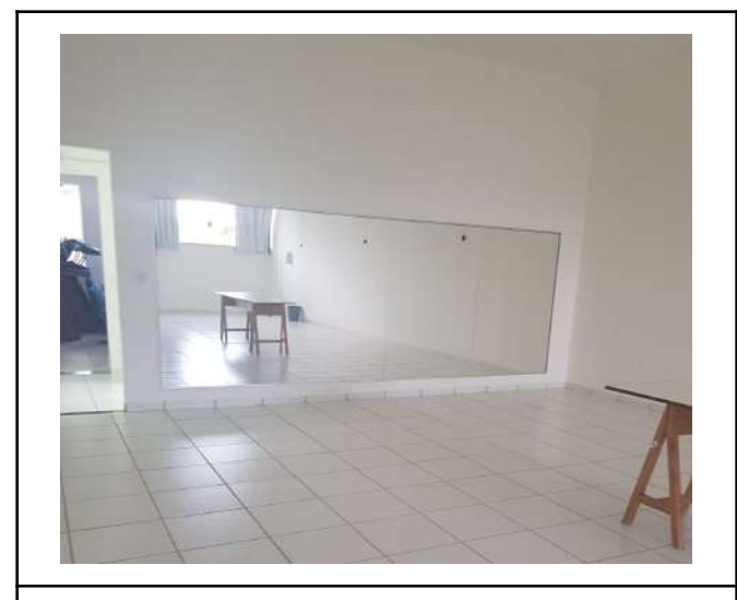
Figure 5: Machado Campus dance and music hall.