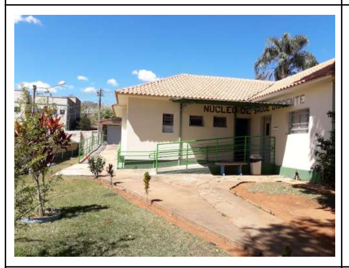
Figure 13: Inconfidentes Campus Student Health Center - infirmary and medical and dental assistance.