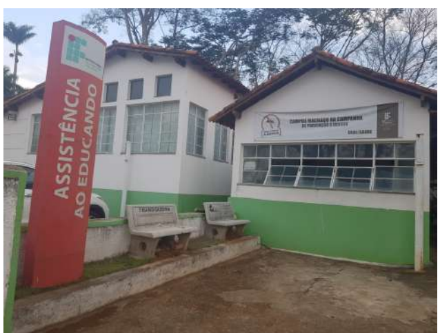
Figure 2: Machado Campus CGAE (General Coordination of Assistance to Students) with psychologists, social worker and disciplinary support.