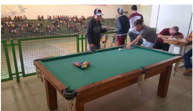
Figure 4: Machado Campus game room.