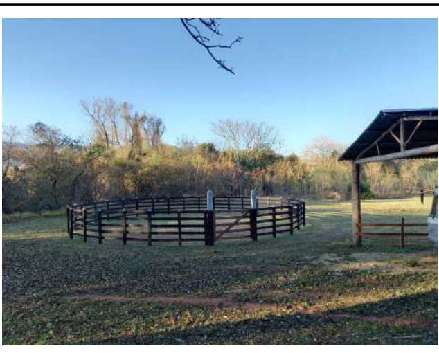
Figure 14: Inconfidentes Campus Hippotherapy Center.