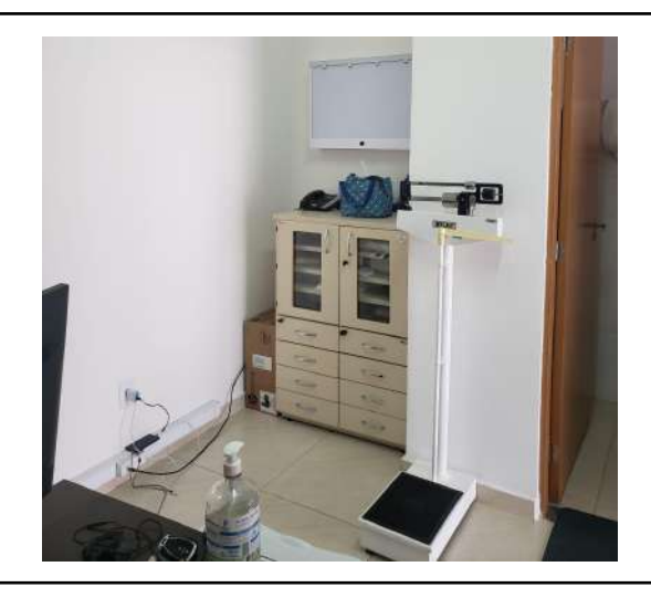
Figure 9: Rectory medical expertise room and infirmary.