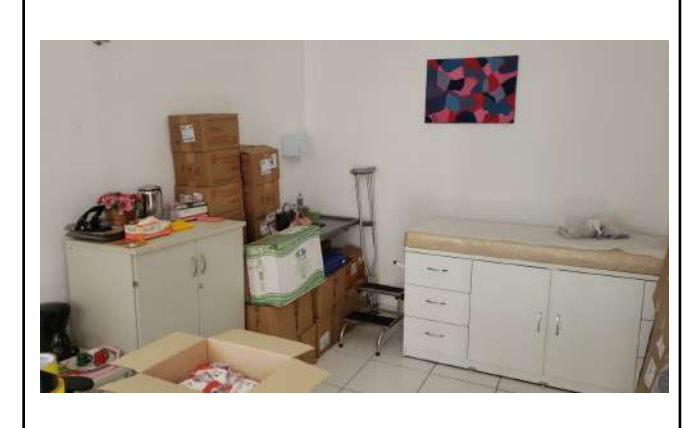
Figure 12: Poços de Caldas Campus Infirmary with boxes of face shields for distribution.