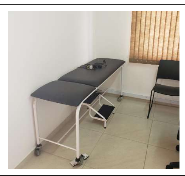
Figure 8: Rectory medical expertise room and infirmary.