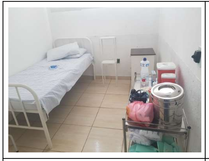
Figure 1: Machado Campus Infirmary.