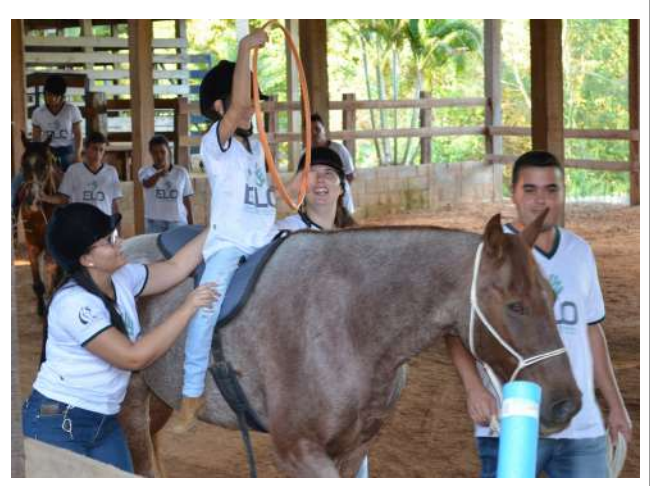
Figure 16: Machado Campus Hippotherapy Center.