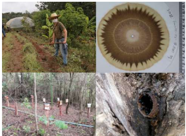
Figure 28: Inconfidentes Campus implantation of the meliponary.