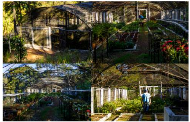
Figure 24: Inconfidentes Campus plant nursery sector.