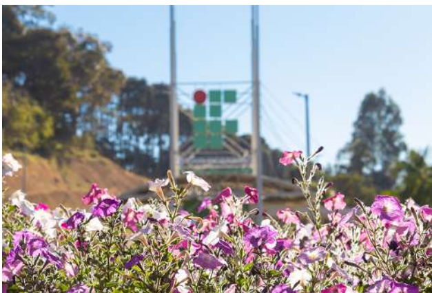
Figure 19: Muzambinho Campus promotes the benefits of landscaping in combating pandemic stress.