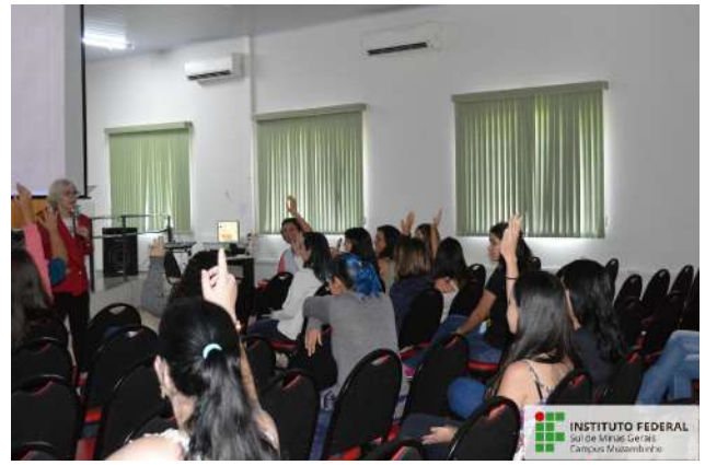
Figure 16: Muzambinho Campus Humanitarian Environmental Education Training in Animal Welfare.