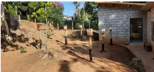
Figure 27: Machado Campus native bee breeding.