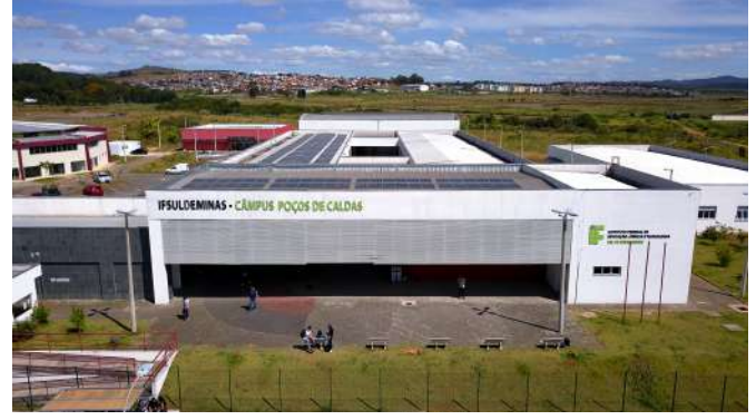
Figure 5: Campus Poços de Caldas Avenida Dirce Pereira Rosa, nº 300 - Bairro Jardim Esperança