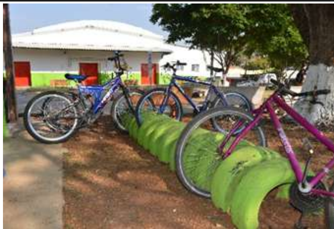
Figure 1: Passos Campus bicycle rack built with tires.