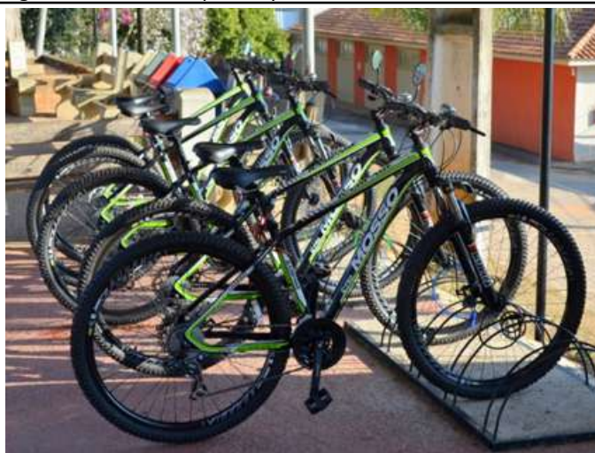
Figure 3: Machado Campus bicycles available for free.