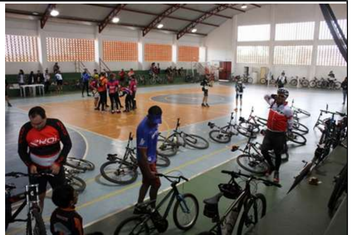
Figure 2: Poços de Caldas Campus cycle tour.