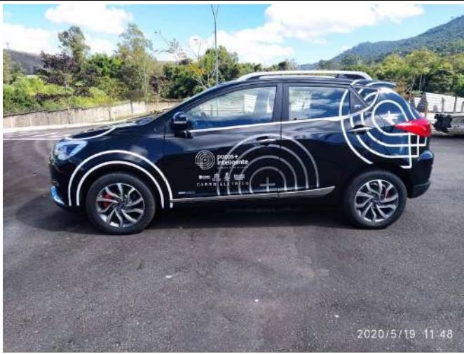
Figure 9: Poços de Caldas Campus electric vehicle - Electric Mobility Project.