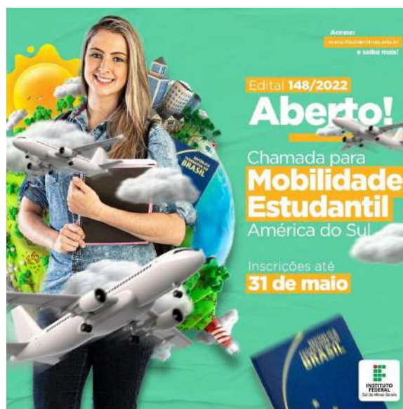
Figure 4: IFSULDEMINAS Academic mobility, international agreements and exchanges .