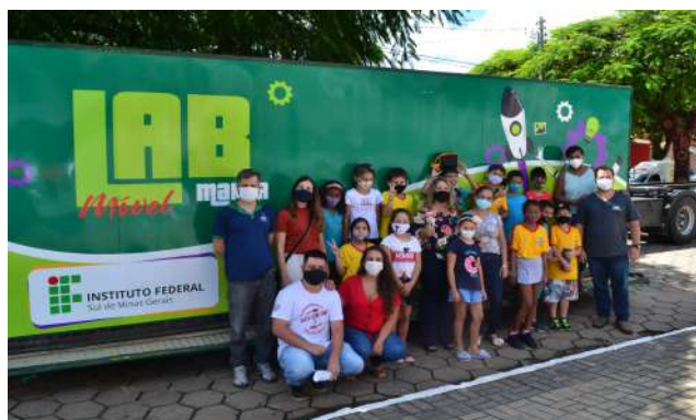
Figure 3: IFSULDEMINAS Mobile LabMaker (Capacita Sul de Minas) .