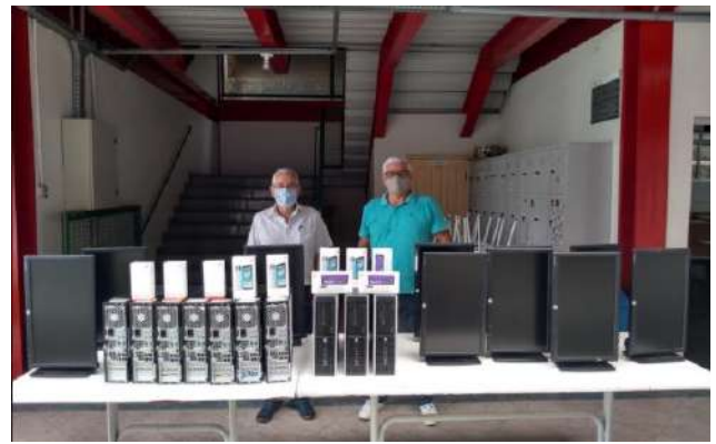
Figure 6: IFSULDEMINAS donation of 250 computers and cell phones to the campuses .