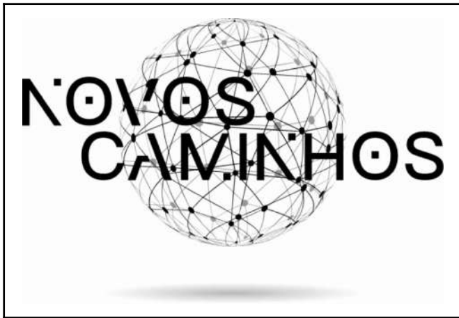
Figure 11: IFSULDEMINAS New Paths Program .