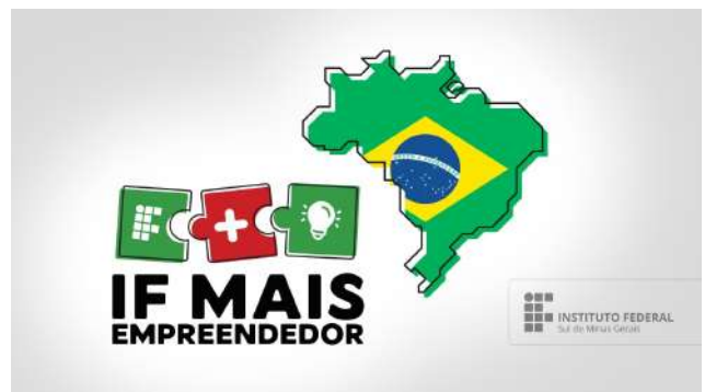
Figure 10: IFSULDEMINAS IF More Entrepreneur Program .