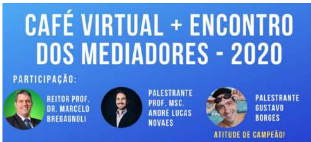
Figure 7: IFSULDEMINAS Virtual Mediators Program .