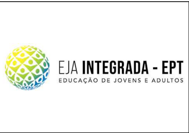
Figure 12: IFSULDEMINAS Youth and Adult Education .