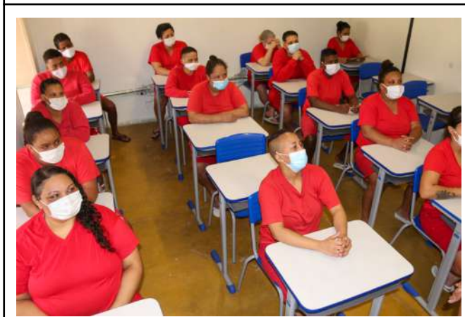
Figure 15: IFSULDEMINAS Minas Gerais Prison System Project .