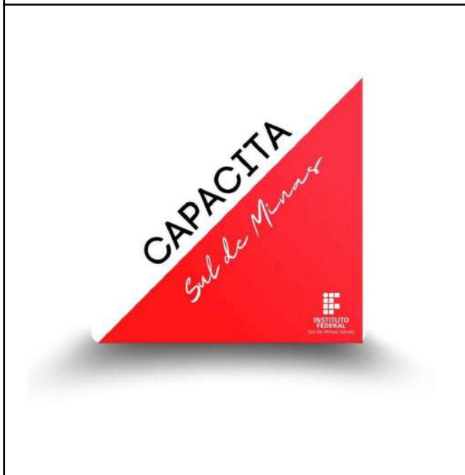
Figure 13: IFSULDEMINAS Capacita Sul de Minas Project .