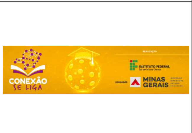
Figure 16: IFSULDEMINAS "Connection Connects" Training in Remote Teaching .