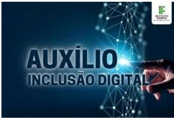
Figure 5: IFSULDEMINAS Digital Inclusion Aid Notice .