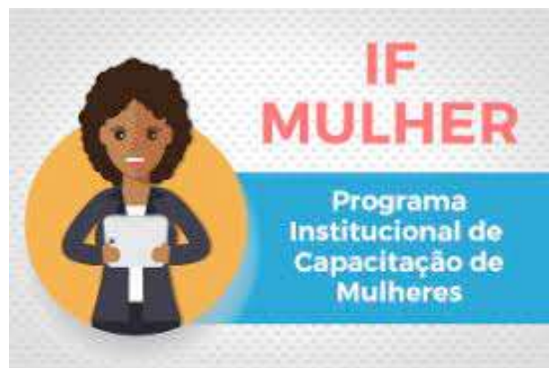
Figure 2: IFSULDEMINAS IF-Woman Program .