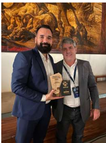
Figure 9: IFSULDEMINAS Portuguese as an Additional Language on the Network Program wins the WFCP Excellence Award .