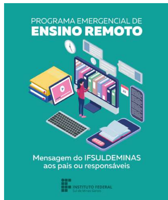
Figure 8: IFSULDEMINAS Emergency Remote Learning Program - PROEN Normative Instruction No. 1/2021 .